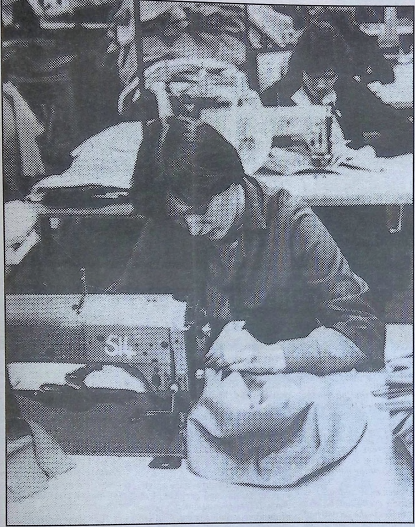
Women worker are particularly vulnerable to low pay

September is a particular nightmare when families are faced with the costs of uni-