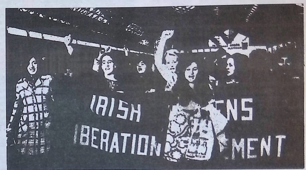
Irish Womens' Liberation Movement - on the Contraception Train

of the Miss World contest at Albert Hall was organised.