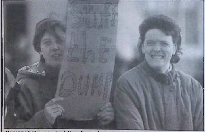
Demonstrating against the planned waste dump in Blanchardstown last month—the picket was called by the local branch of Socialist Worker. National Toll Roads want to build a 387 acre dump in the area, but they can be stopped

Neither this govern-ment nor the last are building enough local authority housing. Instead they want to lie about the debt of the crisis.