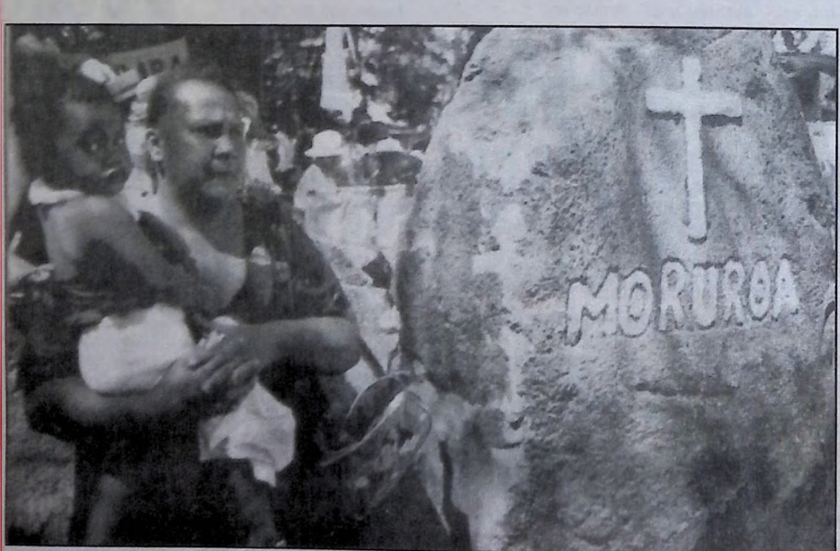
Part of the huge protests in French Polynesia

HUGE protests growing st the are against French govern-ments plans to resume nuclear testing in the South Pacific.