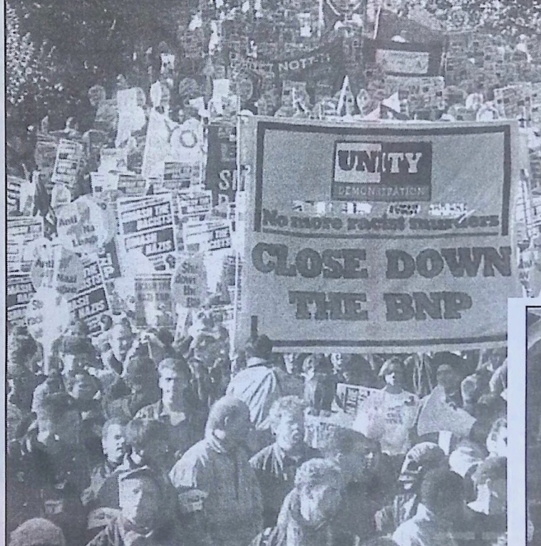
The Welling demonstration—a marvellous show of unity. Marchers faced unprovoked assault by riot police (right)