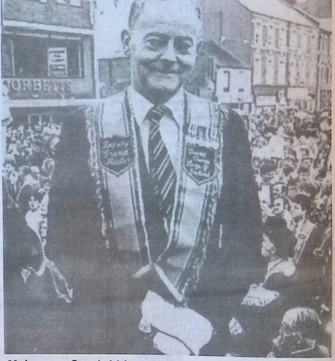
Molyneux: Good riddance

tect "their tradition" and "their commu-nity" so that they can ram through their anti-working class policies. The splits in the Unionist Party should be used to tell every worker that it is time to get the Orange and Green Tories off our backs.