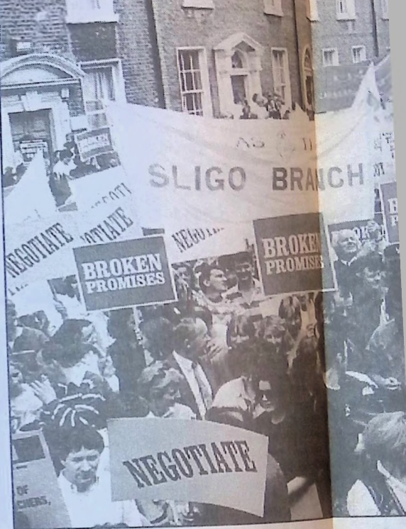
How to fight: Teachers marched for tarily retire

can no longer make a profit for the ruling class are considered a burden on society.