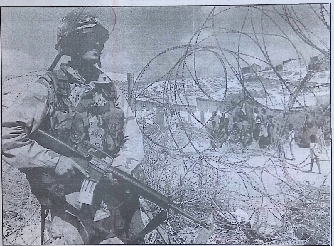
A US marine in Somalia. Far from keeping the peace, the US forces killed hundreds of civilians

stockpile of weapons has grown and become more dangerous.