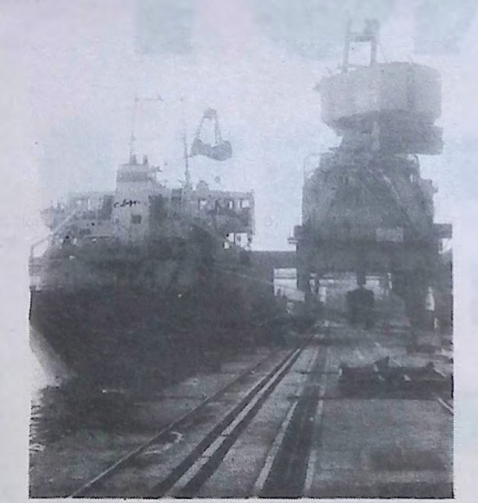
Cranes maintained by scab labour

Dockers, checkers, drivers and ships' officers all voted to strike from the Whit weekend in support of the maintenance workers. In some cases, the vote was 8 to 1 in favour of