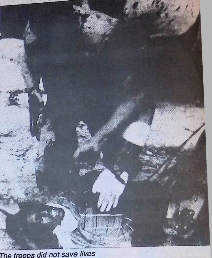
The troops did not save lives

If the political will required for interven-tion had been shown eight months before, it could have been harnessed to do some really important work. Very many thousands of people could have been savod.