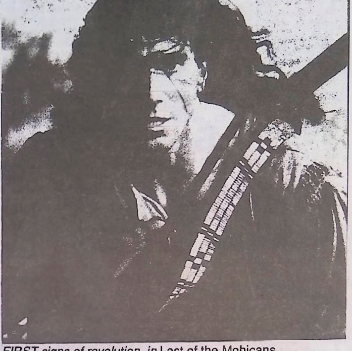
FIRST signs of revolution, in Last of the Mohicans

Director Michael Mann manages to cap-ture all the tension of a social order thrown into chaos under the impact