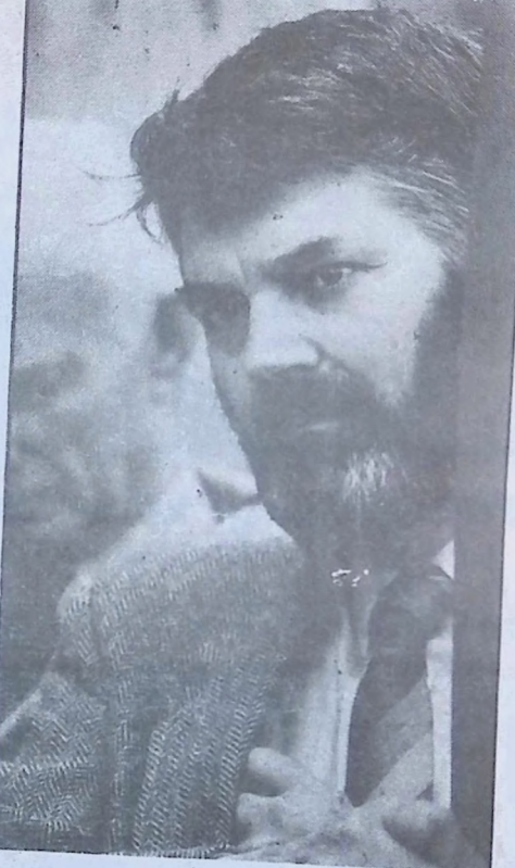
Workers Party luminaries Eamonn Smullen and Proinsias De Rossa