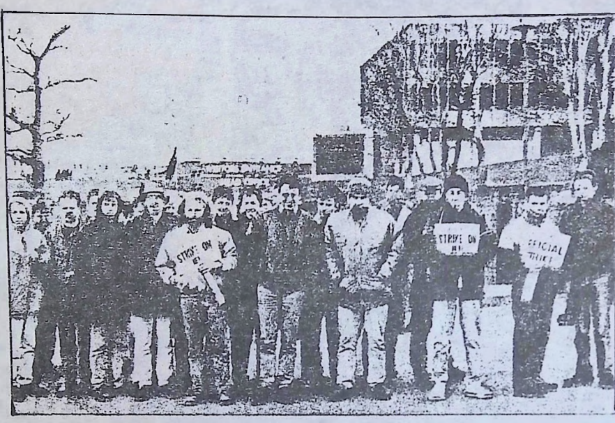
Waterford Glass strikers show the way