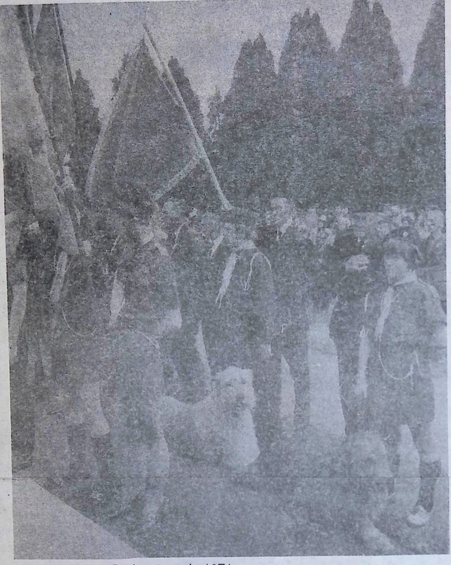
Republicans at Bodenstown in 1971

Throughout Patterson's book he argues that the Republican movement cynically uses workers' struggles and socialist rhetoric when it suits it and