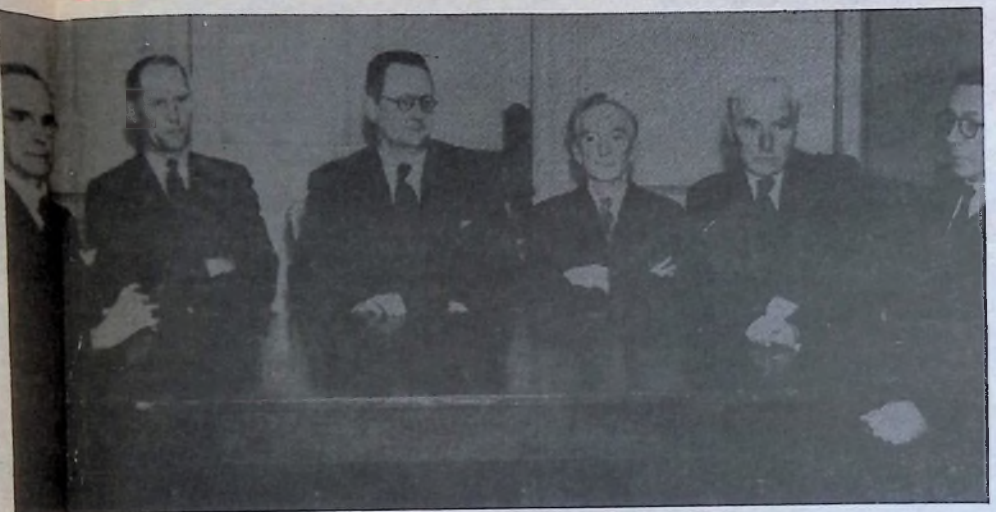
Labour Court, 1946