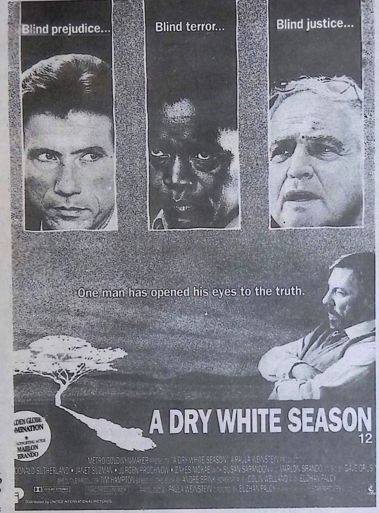
A brave attempt to show some of what is going on

from side streets of the township like tributaries into a broad river, chanting songs of optimism and freedom, then coming to a halt before a wall of stony-faced cops, armoured cars, the paraphernalia of repression.