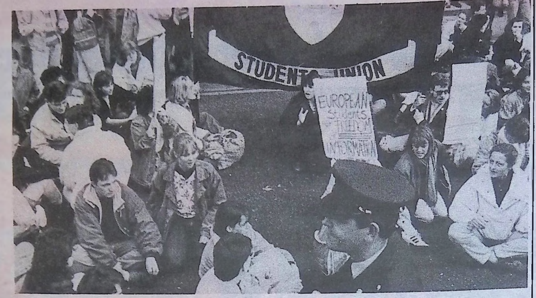
Students take the lead

legal position. But relying on the legal road is inviting defeat.