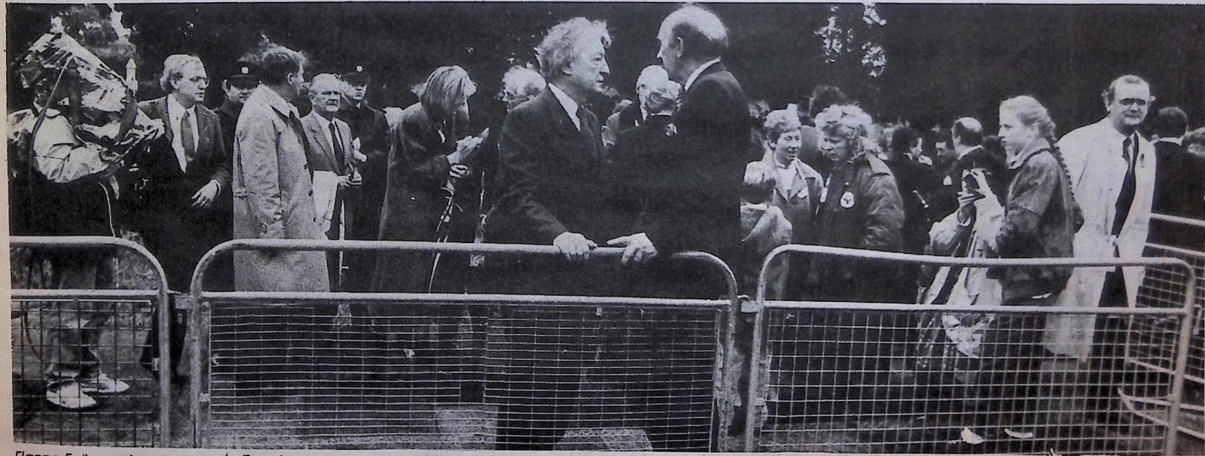
Flanna Fall march every year to Tone's grave