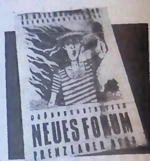
NEW FORUM poster, Gethsemane church

disillusioned with 'socialism' as it has existed here. For them the opening to capitalism, as it is happening in Poland and Hungary, seems like a way forward. The government believes that an opening to capitalism can solve its problems. The economic experts are saying that there is no other possibility. So it won't be easy to get people keen on socialism. It will take a lot of hard work." The Left differs sharply with groups such as Civic Forum in Czechoslovakia, New Forum in East Germany, Democratic Forum in Hungary and Solidarity in Poland on questions such as the market. These reformists believe that exposing the economic problems and loosen the grip of the Communist Parties. Nor is this view confined to a few intellectuals. Just before the upheaval in Czechoslovakia, a study advocating market reforms sold 80,000 copies, with many being pinned on workplace notice boards, and in Poland,