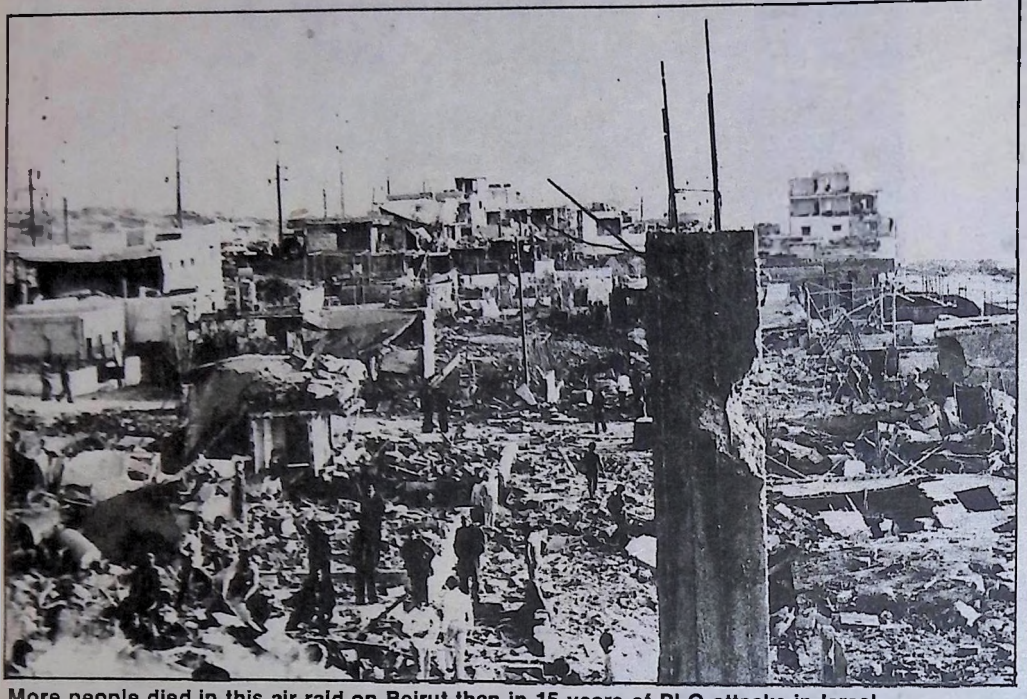
More people died in this air raid on Beirut than in 15 years of PLO attacks in Israel

OVER THE last few months the British and Irish media have been ranting and raving about the attempted bombing of an Israeli jumbo jet at Heathrow Airport in April last