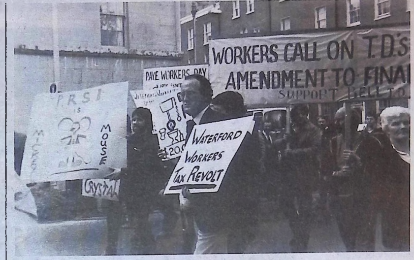
Tax protests last time round

No doubt this defeat will strengthen the hand of the trade union leadership who can claim that the membership are conservative and don't want to do anything, not just on Tax but on other