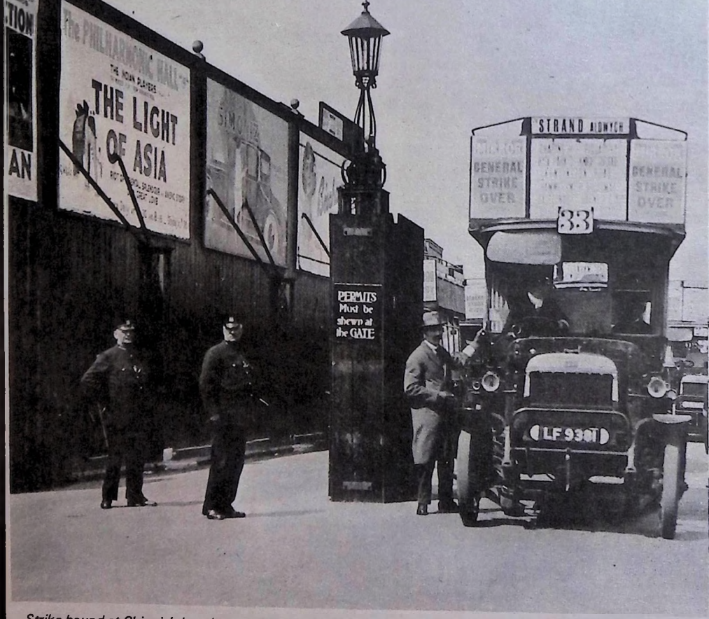
Strike-bound at Chiswick bus depot.

The tragedy there existed in the rank-an organisation challenge the leadership of This is the less largest for wo Ireland as much