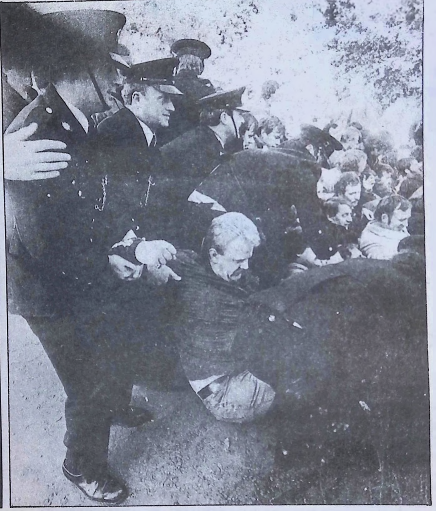
Pickets being removed by Gardai from in front of the Cork Water Works

All meetings start at 8 pm. See posters and leaflets for details.