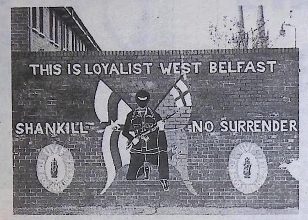
Fails to confront Loyalism

Catholics were burnt out of their homes in Belfast; in Banbridge and Dromore the attacks were so bad that ALL Catholic families fled the two towns.