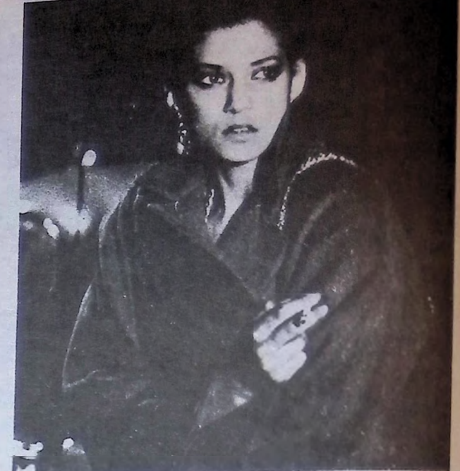
MONA LISA—turning the old thriller plots upside down

terms of political gains. Socialists can only be disgusted by the attacks made on the "political strike" by the likes of Barry Desmond, Rosa Luxemburg shows how economic struggles inevitably raise political questions like whose side the cops are on. An accumulation of such questions especially if there are revolutionaries around suggesting answers, can result in mass strikes adopting political aims. An atmosphere of political tension can unleash economic struggles among workers who may never have been organised before. In this way a mass strike can involve a chain-reaction of everincreasing intensity, which—a Rosa Luxemburg forsees in this book—heralds the death of capitalism.