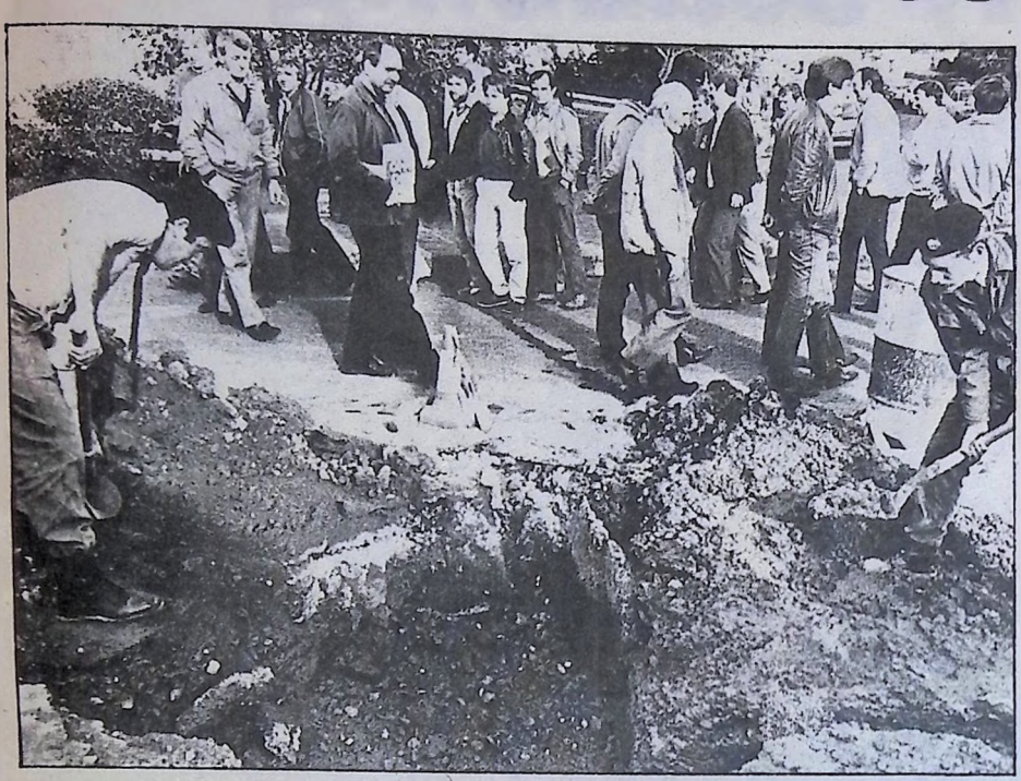
Gardai scabbed on ESB linesmen, now it's the army.

LAST YEAR, ESB linesmen in Cork went on strike to protect their jobs and conditions. Their battle was an inspiration to all trade unionists.