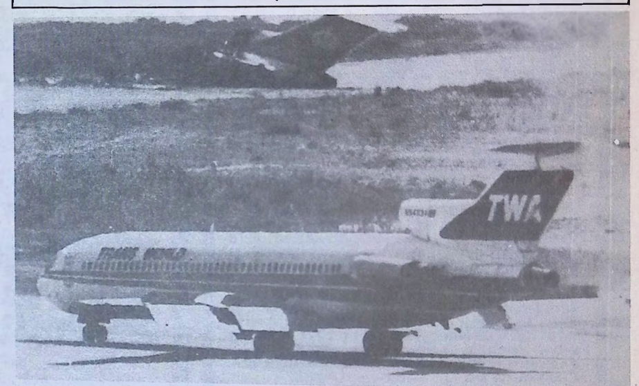
The bijacked TWA in Beirut

None of this induces us to take up the hypocritical chorus of condennation of "terrorism" on behalf of the class of people whose actions and whose system is ultimately responsible for this situative state. ion—the US boss class.