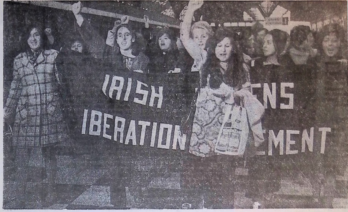
Members of the Irish Women's Liberation Movement arrive in Dublin's Connolly Station after illegally importing condoms from Belfast.

women impregnate them-selves, i.e. exemplified by