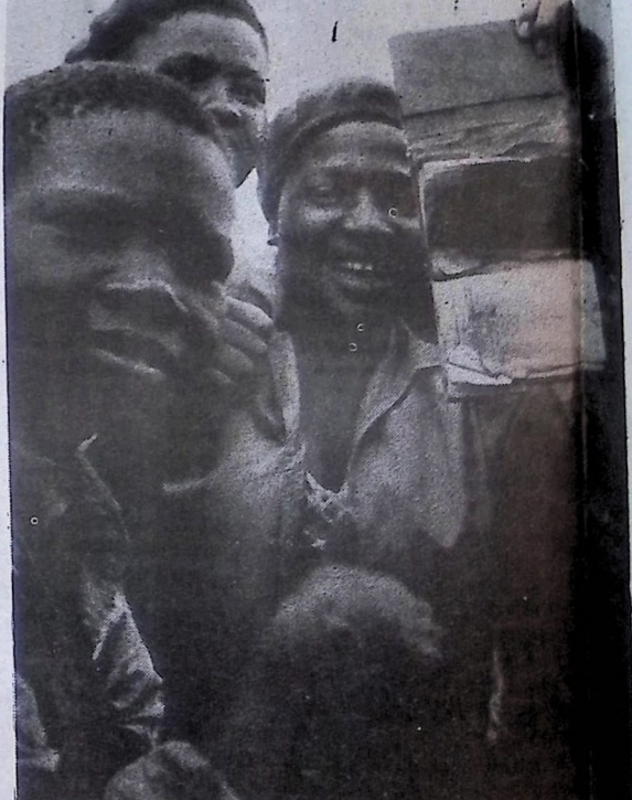
(Left) Sharpeville after the massacre. (Above) A woman holds up her burned pass book on the day of mourning for the Sharpeville dead