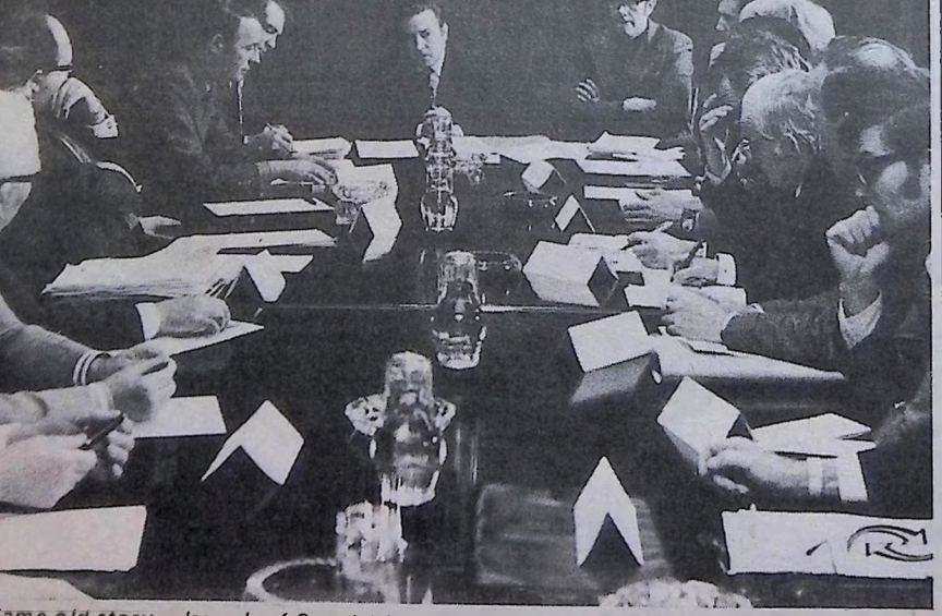
Same old story -- launch of Buy Irish Campaign in December 1974

can make large profits out of their production.