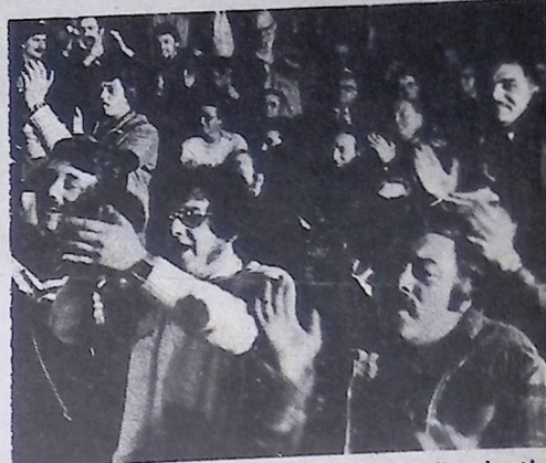
WORKERS' revolutionary potential lies in the collective nature of their struggle