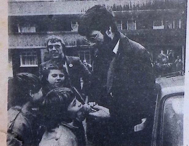
Burke & Adams look for the youth vote in Dublin Central