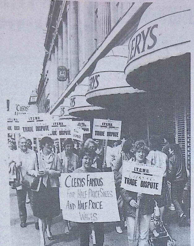
Clery's workers striking for pay and conditions

The CUAG produces its own paper 'The National Crumb' which sells very well on the labour exchange. However the separate unemployed group around the country need to links with each other to build a fighting organisation. They also need to make the links with rank and file trade unionists because it is only through that link that we effectively fight the scourge of the