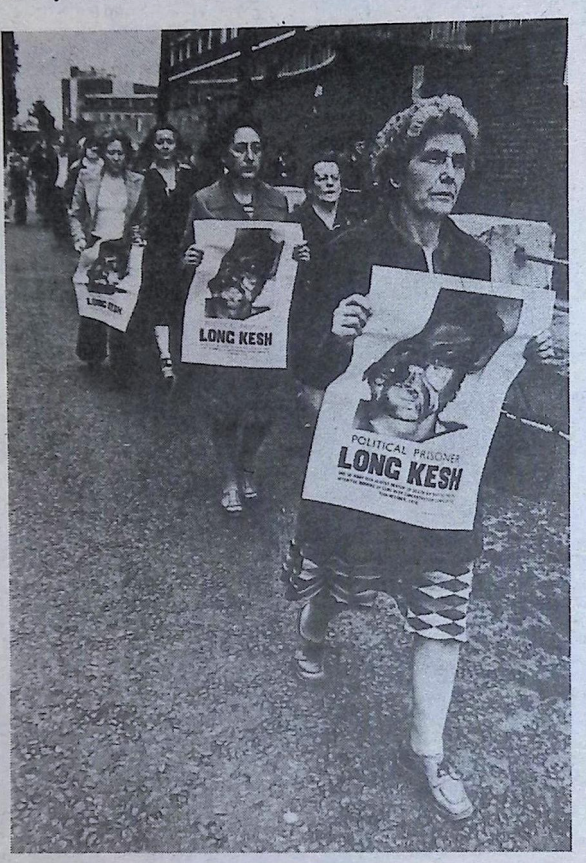
The women were sent off stage again

This tendency and the view of history expressed in the book—ie that to date all history has been 'male history' made the book get on my nerves from time to time.