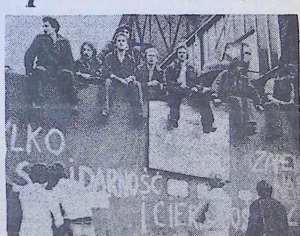
Strikers perch on a wall at the Lenin Shipyard, Gdansk, as passers-by read their slogans

AS WE go to press, hundreds of thousands of Polish workers are continuing their strike for free trade unions and other reforms.