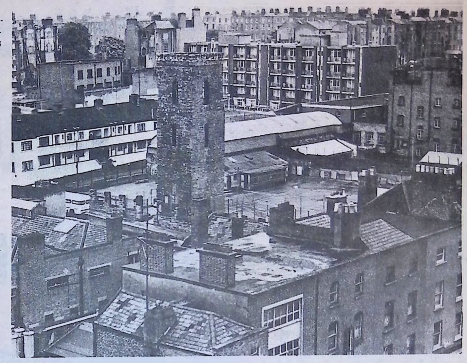
Government spending cuts are responsible for desperate housing shortage.

Waterford has the oldest housing stock in the entire