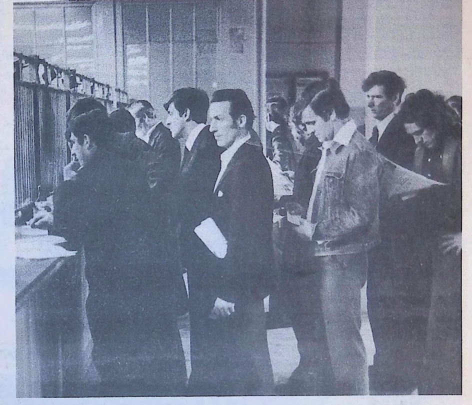
A National Understanding-100,000 unemployed