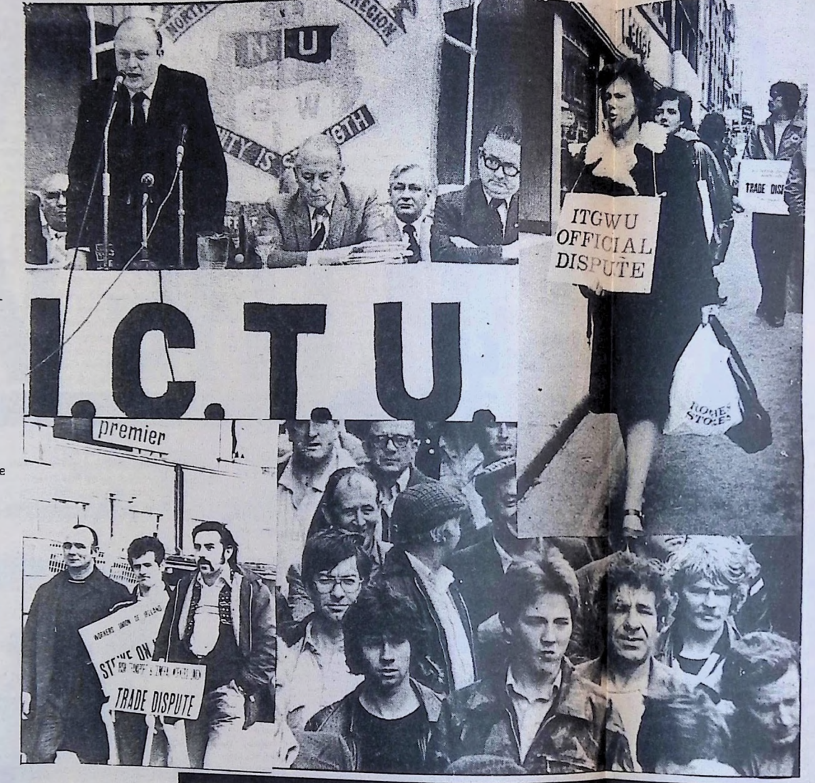
Photomontage, photos Derek Spiers.

tantly, all union officials must have been worcancy of the rank and file craftsmen . A Goviployer backed agreement gave the bureaucracy against the rank and file. Secondly, national a not new in 1970. Since 1946 there were ids, five of which were nationally negotiated as bargains being won by particular sections and pargama being the actual amount of the 1970 e cutting effects of double-figure inflation, here have been seven more NWAs. In total the led 17.9% to average industrial wages (up to led 17.9% to training and the same nent). But inflation has been 22.2% in the same ment). But the same need wages over the 9 years. At the NWAs in cutting red effects of the NWAs in cutting real wages have effects of factors. These include clever, a number of factors, distorted for a number of tax allowances, distorted figures for ggling of tax allowances, distorted figures for ggling of inflation, and worst of all, unions have rates of inflation agreements, thus sellirates of interest rates of all, unions have te productivity agreements, thus selling jobs to te productivity agreements, thus selling jobs to te productivity agreements, thus selling jobs to nable wages. Finally the Labour Court and operate the NWAs to the letter thus discourage operate.