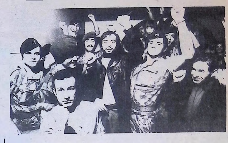
Portugal's radical and revolutionary soldiers are making it impossible for the Sixth Government to restore discipline in the army, as they aimed to do. Following the lead of SUV they have held some of the biggest demonstrations seen in Lisbon for some time. In the barracks, there have been many more examples of the kind of revolt detailed alongside.

Further demonstrations led by soldiers have since taken place. They are heightening the divisions in the army between the rank and file