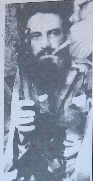
The Cuban style

struggles. It is on the development of similar struggles in the Third World – though the working classes there may be only a small minority of the popularion – that the future hopes for socialism in those countries must be based. They may be small, but with the example and the help of victorious working-class movements in the Western countries and also in Eastern Europe, they can succeed.