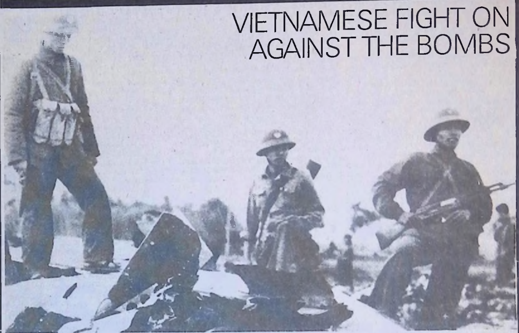
B-52 downed by North Vietnamese gunners

Many workers may feel that jailed dockers and MacStiofain or O'Bradaigh are very different things. Indeed they are. In defending Provisionals against repression, we are not supporting their politics. But the republican movement is an obstacle to imperialism's plans for the whole of Ireland. If it is beaten, it will be a victory for the capitalist class and a defeat for the workers. Lynch is building up an apparatus of repression which can be used against any opponent of the status qua republican. socialist, or trade unionist. Workers have shown, spontaneously, the way to stop him. There must be a joint campaign by working-class and anti-imperialist organisations to mobilise workers against repression. There have been some signs of this happening. In Monaghan a civil rights committee has been set up, including both wings of the republican movement, and local trade union branches.