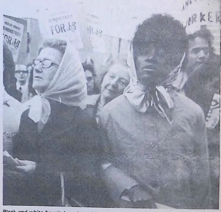
Black and white hospital workers demonstrate against the Tory freeze

1972 was a 'Boom Year'. Apart from being a sick joke, that statement is certainly true for investors and share-holders. Industrial shares on the Irish Stock Exchange increased 80 per cent in value during the year—the sure mark of increased profits, and increased exploitation of the working class.