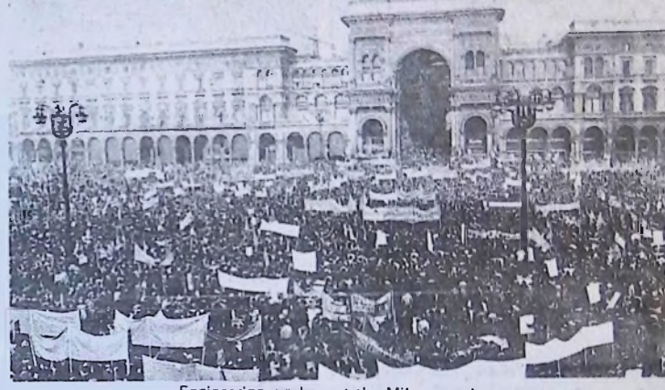
Engineering workers at the Milan meeting

Engineering workers at Every three years, the 'contracts' which govern wage levels for many thousands of Italian workers, are renewed. They correspond roughly to the National Wage Agreement in this country. In 1969, the struggle over the contracts led to massive demonstrations, factory occupations, and violent clashes between strikers and police. Two months ago, 200,000 engineering workers assembled in Milan to launch the struggle for 1972-73. This was exactly twice the number that met on the same occasion three years before. Since then, there have been strikes in many sectors, with up to 3 million on strike at one time. Bank clerks were among the most recent to strike, complaining, in particular, of the effects of V.A.T. on prices. Railway workers were due to strike at Christmas, but called off their action when an agreement was signed.