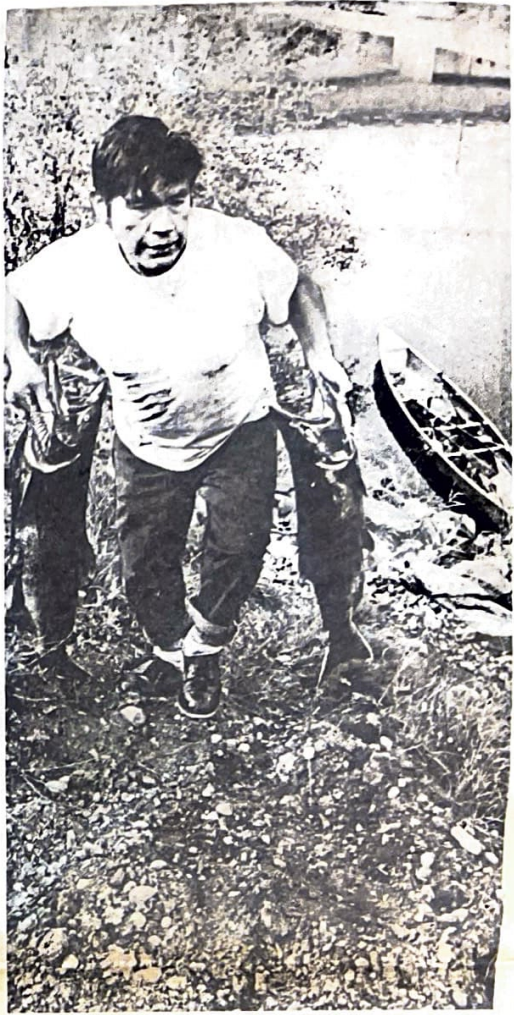
INDIANS IN WASHINGTON STATE DEFY FISHING AUTHORITIES

Recently the U.S. reactionary authorities have stepped up their repression of the minority nationalities. The Nixon administration has used brute force at will to slaughter the Afro-Americans and Mexican-Americans. However, no reactionary in history ever saved himself from doom with a butcher's knife. The atrocities of the Nixon administration can only serve to further awaken the minority nationalities in the United States, who will unite more closely and wage fiercer struggles. So long as the minority nationalities in the United States unite closely with the broad masses of other American people and the revolutionary people of the world in the common struggle, they will certainly win victory, bury U.S. imperialism once and for all and achieve their own emancipation.