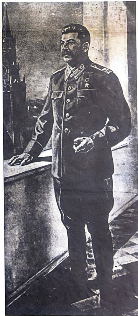
COMRADE JOSEF STALIN PERSONALLY GUIDED THE HEROIC SOVIET PEOPLE TO VICTORY OVER GERMAN NAZISM IN THE BATTLE OF STALINGRAD, OCTOBER 9, 1942.

All those who take a pessimistic view of the world situation should change their point of view.