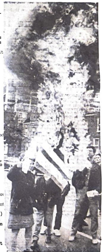
IRISH REVOLUTIONARY YOUTH AND STUDENTS BURN A U.S. IMPERIALIST FLAG IN ANTI-NIXON DEMONSTRATION DURING NIXON'S VISIT TO IRELAND.

by air post anywhere in the world - $4 monthly