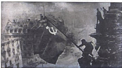
SOVIET RED ARMY SOLDIERS FLY THE RED FLAG OVER THE CAPTURED REICHTAG WHEN THE RED ARMY LIBERATED BERLIN FROM THE NAZIS IN 1945.

This utter exposure of the paper tiger nature of the fascist JDL is of great significance in a manner exactly the same as the fascist professional "hard-hats," the JDL has been promoted by the monopoly capitalists to intensify contradictions among the people, build a fascist mass movement and intimidate the progressive people. Our comrades smashed them in the exact same way as we exposed and smashed the vaunted "hard-hats" in Cleveland July 26—by taking up mass democracy as a weapon, "FEARING NEITHER HARSHIP NOR DEATH" and using Mao Tseung thought as our guide. This great victory fully demonstrates the truth of Chairman Mao's revolutionary thesis: "ALL REACTIONARIES ARE PAPER TIGERS." It is the most concrete support to our Arab comrades who are struggling against Israeli Zionism and U.S. imperialism in the Middle East and is a great step forward for the revolutionary movement in the U.S.