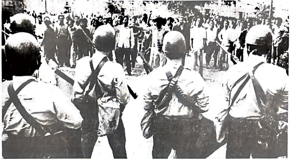
REVOLUTIONARY MASSES OF NEW ORLEANS EXPRESS THE SPIRIT OF UNCOMPROMISING RESISTANCE TO FASCISM.

In Honor of the Heroic Defense of the Black Panther Headquarters by the Black People of New Orleans, Nov. 19, 1970