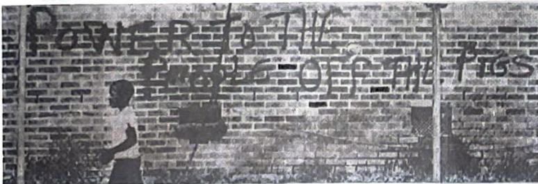
"BLOOD DEBTS MUST BE PAID IN BLOOD!"