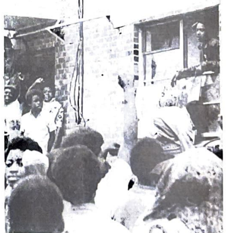
A GREAT CHEER GOES UP AS VICTORY IS ANNOUNCED FROM THE NCCF HEADQUARTERS