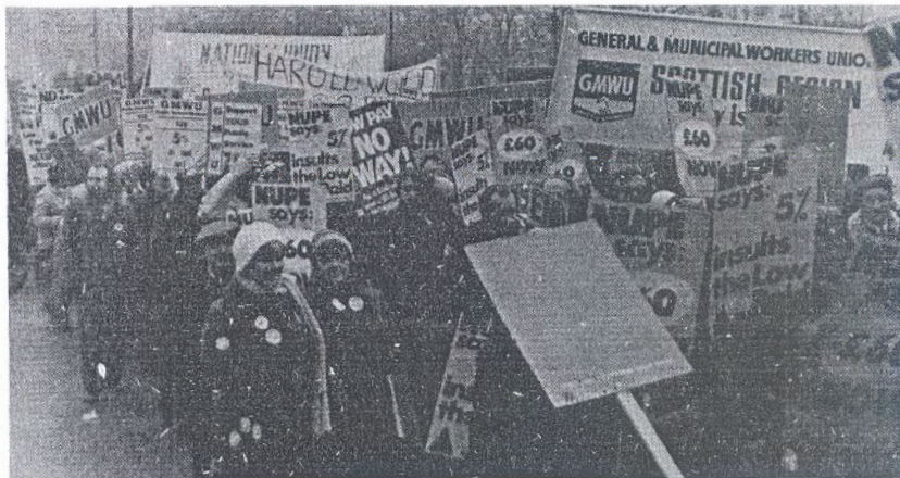
"Day of Action" 22 January, 1979.

The workers at Leyland will have to organise themselves to prevent any further erosion. The fight to force more money out of the company must not become a further demoralising acceptance of this management's plans. The working class will have to save Leyland and British industry from capitalist destruction.