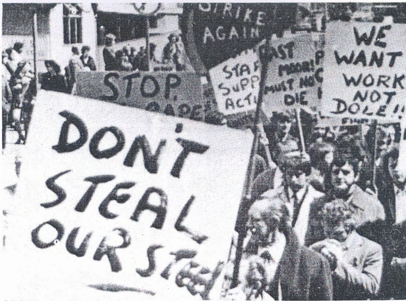
East Moors Steel Protest, 1973.

THE Queen's visit to the Gulf states has acquired further significance ever since the people of Iran declared her 'persona non grata'. It is openly admitted that her visit, coupled with the 10 day tour by the US Secretary of 'Defence' to the Middle East, is an attempt to reassure oppressive rulers of Anglo-American support against any popular uprising. It is an open admission that Hussein, Feisal, the Sheikhs and Emirs of the Gulf rule only by courtesy of imperialism.