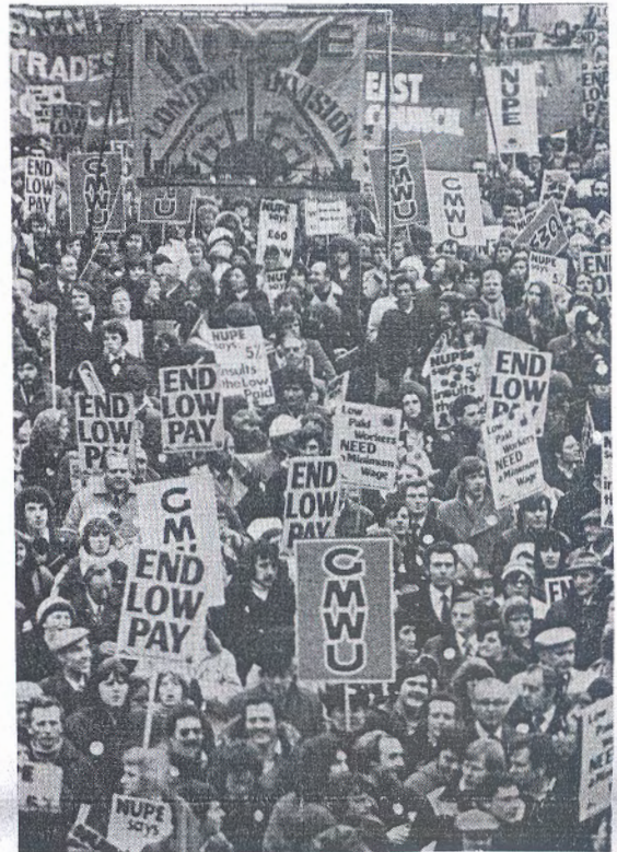
110 000 march against Government. Photo: A. Ward(Report)

It is that coherence which is so frightening the Prime Minister that he is outdoing the Tories in calling for people to scab and strike-break. We have to see to it that the TUC reflects that coherence in its stand vis-a-vis Callaghan.