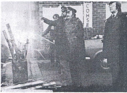
Ambulancemen picketing on the day of action

The Governor of the Bank of England has laid down the capitalist law on wage increases. He sees inflation and more unemployment. Healey does not just see it but threatens it. He says taxes will be increased, along with unemployment. Ennals, responsible for the closure of more hospitals than any other Social Services minister, leave alone all the casualty departments closed down, accuses ambulancemen drivers of putting people's lives at risk. How long more the hypocrisy, the open threats and the low pay?