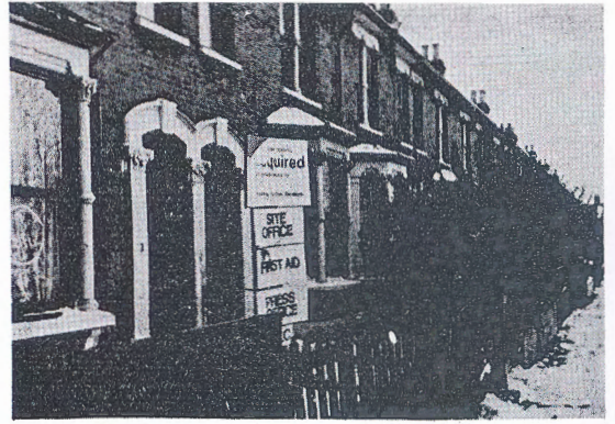
Ilford houses occupied before their destruction.

Southwark has one of the worst records for housing destruction,