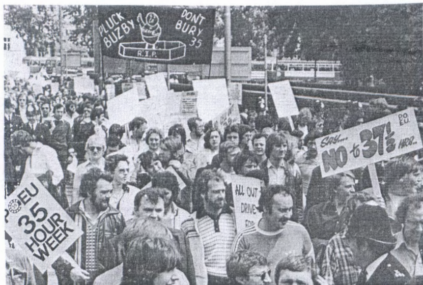
Members of the Post Office Engineering Union demonstrating in London as part of the action to advance their demand for a 35 hour week. This demand as an improvement in living conditions is gaining support as many recent trade union conferences have shown. The Post Office management is resisting the claim for reduced hours without loss of pay on the grounds that it is in breach of the guidelines which the POEU is correctly ignoring.

Published by the Communist Party of Britain (Marxist-Leninist) No 26 20th July 1978 5p