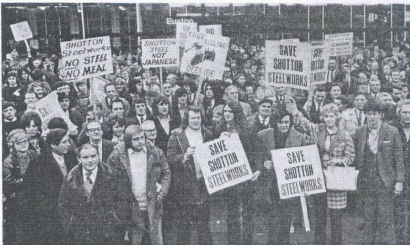
Steelworkers demonstrate against closure in 1973

The paper from the DES is couched in woolly and superficially conciliatory terms. The proposals set up a machinery for long term control of Students' Unions. The only reply can be their decisive rejection. A Conference resolution is but a part of the assertion of the independence of the National Union of Students. The real point will be made by campaigns mounted on the issues facing the movement - grants, cuts, tuition fees - the use of union autonomy in defence of the Union's membership.