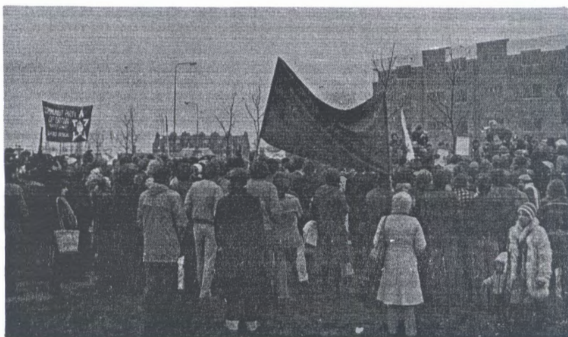
E. P. Thompson addressing a rally against cruise missiles in Oxford last March. He has taken a leading role in the campaign to stop the deployment of U. S. missiles here.

Available from the Bellman Bookshop, price 45p + p&p.