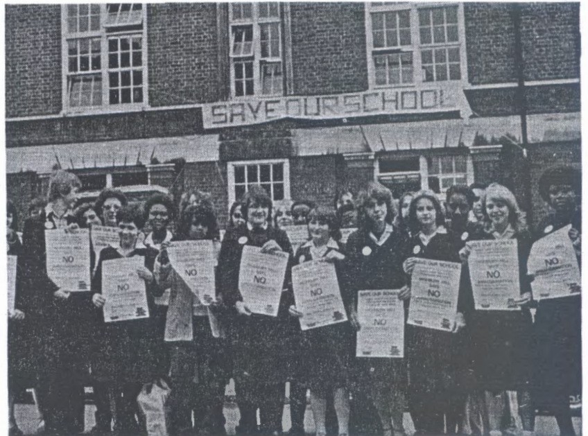
Pupils at Highbury Hill School in Islington who took an active part in the campaign to save the provision of secondary education in the London borough. The Thatcher Government has just taken an outrageous decision: that the proposed Highbury Hill amalgamation with Shelburne School should go ahead, but Highbury Grove, pervasively associated with Education Minister Rhodes Boyson, should remain unscathed. Despite falling rolls in the area the Government has decided the numbers at Highbury Gove should not be reduced, and the proposed partner in the amalgamation of the boys' schools, Sir Philip Magnus, should be closed. Much anger has been aroused by the decision, and the Fight has been raised to a new level.

ferent laws, one covering policemen, another everyone else. Only last week at Brighton, thousands of young people were stopped and searched. Many had their boot laces confiscated because they were judged to be 'offensive weapons'. But coachloads of SPG out on a jamboree to the nearest demo are left alone to carry their varied and obscene weapons. Where is the justice in this land?