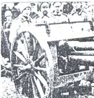
Photo: Bolshevik supporters defend the Moscow City Soviet.

56 years ago this month the first workers' state was triumphantly born under the slogan, "All Power to the Soviets" - the workers, peasants' and soldiers' councils. Won by the united proletariat and peasantry of Russia, led by the first Marxist-Leninist Party in the world, it proclaimed its victory with the statement: