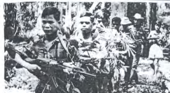
Fighters of a regional unit of the People's National Liberation Armed Forces of Cambodia on the march.

the capital, were fired on by troops. Hundreds were killed or wounded, but the people fought back. Government buildings were attacked and police stations set alight. This continued for two more days until the Prime Minister and his Deputy, both Field Marshals, were compelled to flee the country. With the USA involved in backing another puppet, Israel, in West Asia, the last thing it wants is further unrest in South East Asia. These are early days yet, but the situation looks ominous for imperialism. In the quiet before the storm, you can almost hear a domino falling.