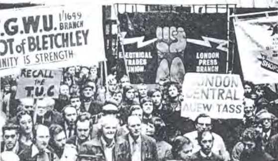
Meeting of workers from all trades who demonstrated with the engineers outside the Industrial Relations Court.

We fully support the correct policy of the AUEW of non-cooperation with Industrial Relations Act and of all the bodies set up to it. In this stand we recognise the leading role of the AUEW in fighting this blatantly class legislation. They should not be left to fight isolation for this is an issue that must involve the whole class."