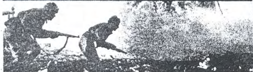
From "THE OATH OF THE DEFENDERS OF STALINGRAD", November 6th 1942.

The Military-Revolutionary Committee of the Petrograd Soviet of Workers' and Soldiers' Deputies.