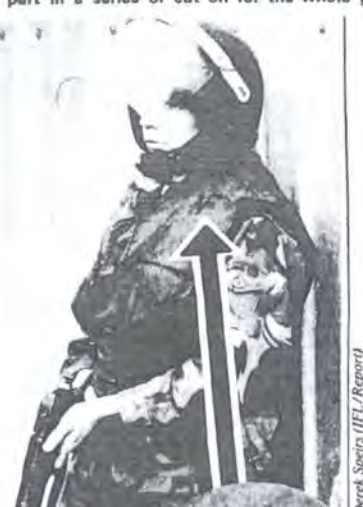
Derek Speirs (IEL/Report)

98,894 families last year had their electricity cut off for not being able to pay their bills. 15,000 of these were cut off for over a month. Some were cut off for the whole year.