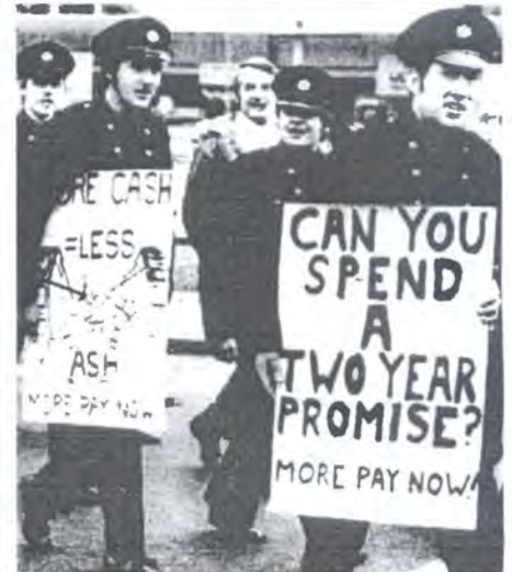
Fireman two years ago. Now even their two-year promise has been reneged upon