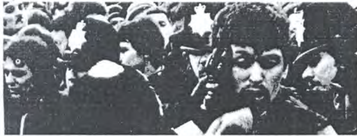
Pickers under attack from Police