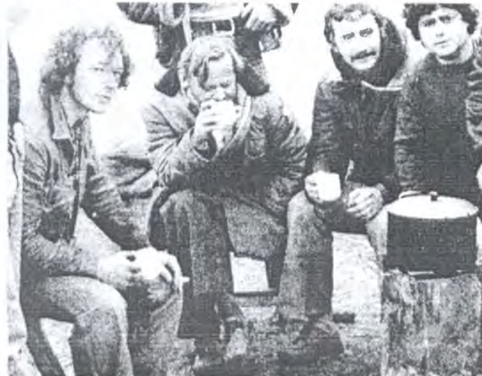
New Tory laws say six is company, seven is a riot

The Tory version of an employment 'protection' Act is now law