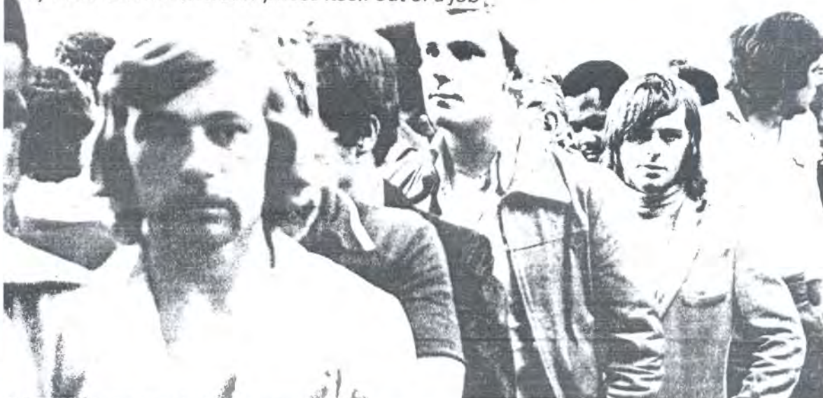
ABOVE: faces of a few from the many hundreds of dole queues which now populate the country. Figures quoted below from early in the Autumn have now escalated to more than 20,000 a week

by the Class which never prices itself out of a job