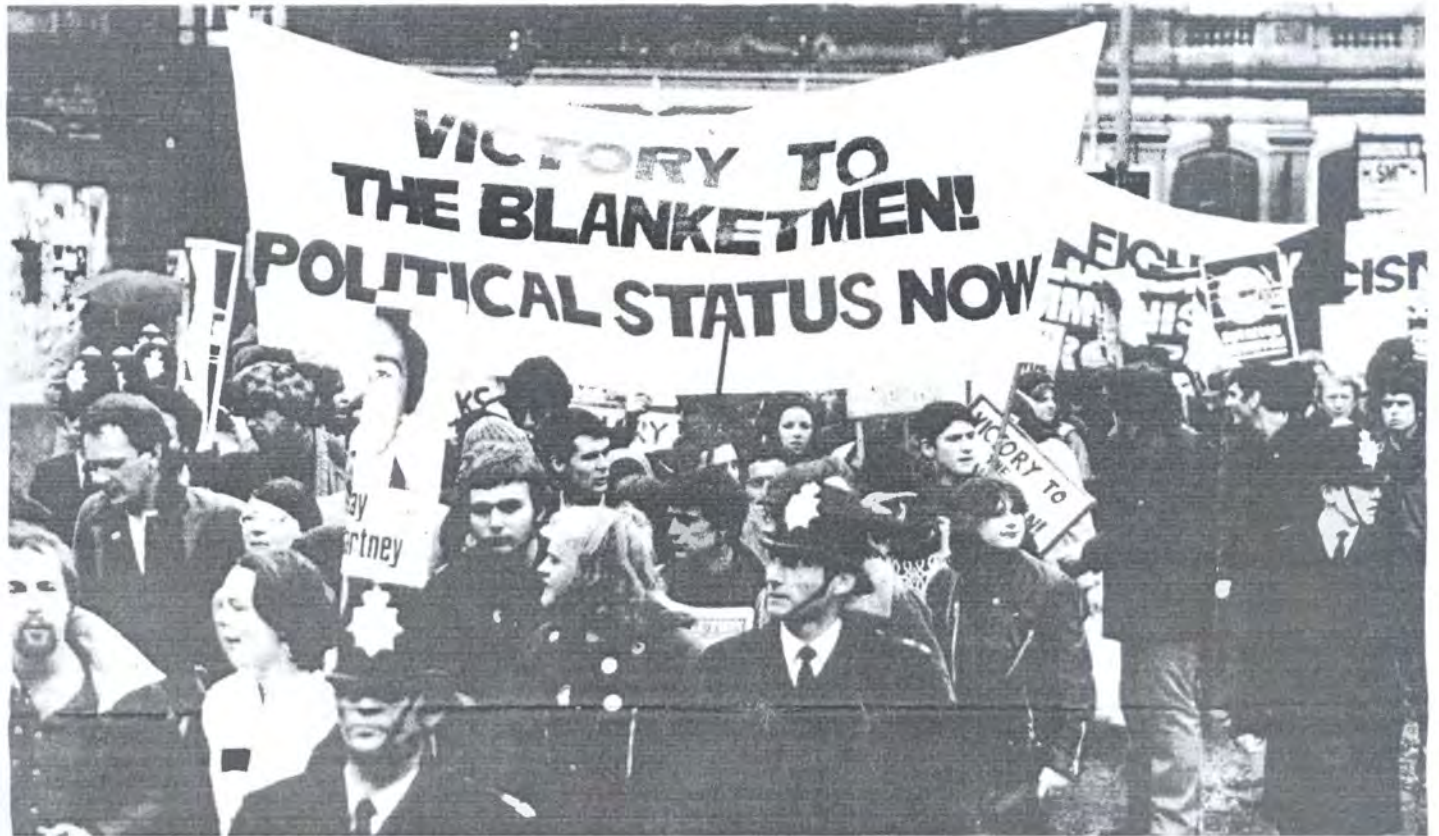
A recent demonstration in London, in support of the struggle inside H-Block concentration camp