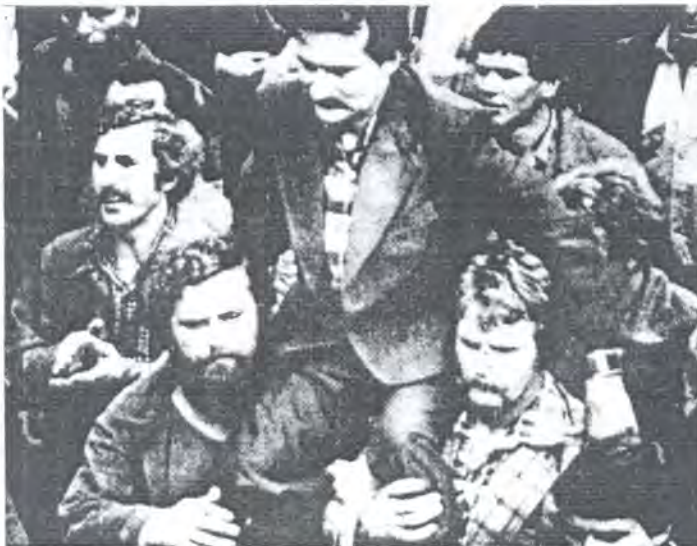
LECH WALESA: in triumph. But will this prove a true and lasting triumph for the Polish working class imperialist in deeds, eg the invasion of Hungary, Afghanistan, etc) on the other.

The above line-up was to be entirely expected. There is nothing unusual or unexpected about it. Indeed, there could not possibly have been. The reason is that these elements are the opposing factions, the supporters clubs, which on every major political issue side behind one of the two major reactionary (anti-people) forces on our planet today, namely the camp of US imperialism on the one hand and Soviet Social imperialism (socialist in words,