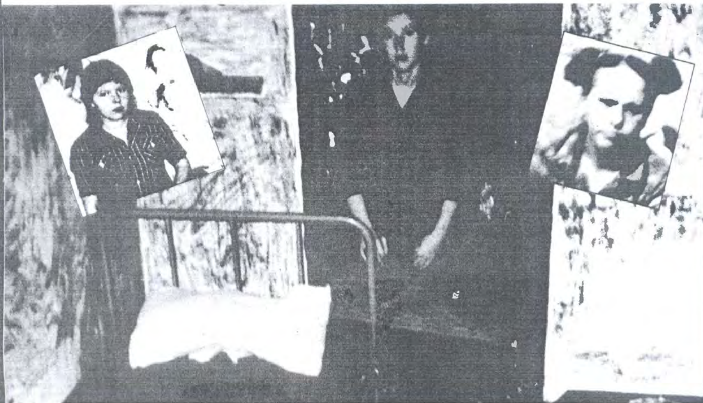
Women in Armagh Prison

THESE PICTURES highlight the fascist conditions being imposed on Irish people in the north of Ireland by the British ruling class. Conditions imposed in order to protect their imperialist interest there, the interests of the rich and powerful British industrialists, bankers and property owners who are continuing the centuries old exploitation of the people and resources of Ireland.