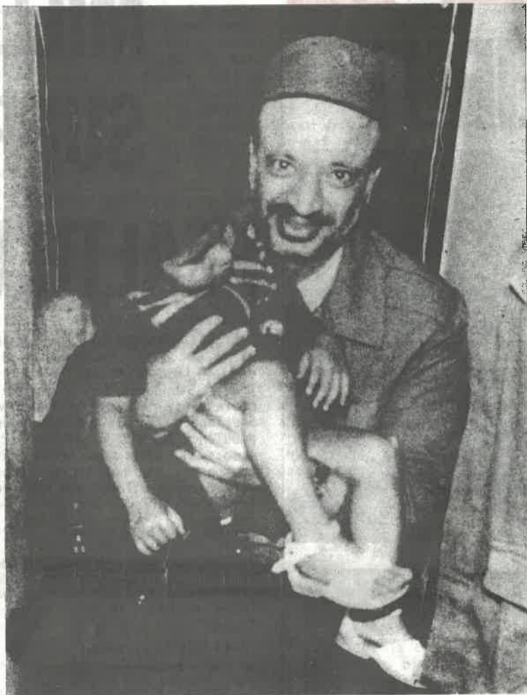
Yassir Arafat carries a child from a Beirut air raid shelter.