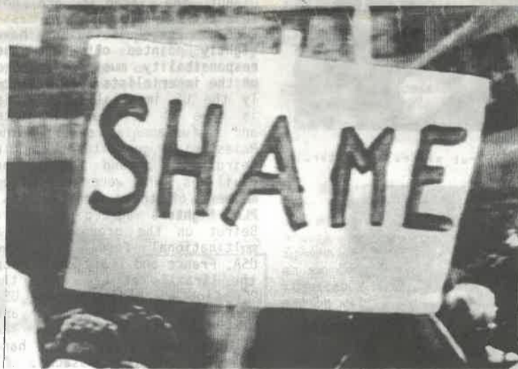
Demonstrations in Israel against the massacre