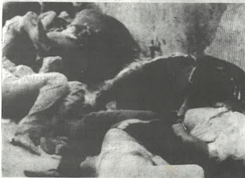
The dead amongst the rubble in west Beirut