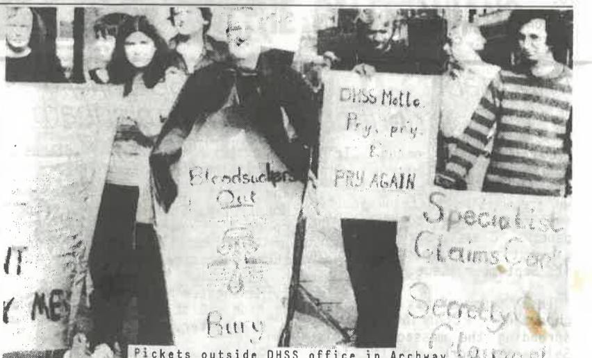
Pickets outside DHSS office in Archway.

The Day of Action showed unmistakably the massive support that exists in the working class for the healthworkers. The working class will have to be on guard to ensure that support is not betrayed by the TUC leadership, in the same way that they betrayed the train drivers.