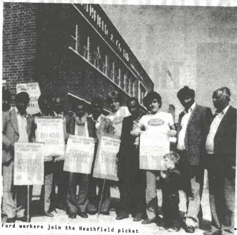
Ford workers join the Heathfield picket

Intimidation of the black pickets includes the daubing of racist graffiti on one of the factory entrances and the sabotage of their transport with locks 'super-glued' and sugar put into petrol tanks. But they are determined to fight on. Their defiance is based on the developing support and unity forged from their stance. Strong support is coming from both Slough's Asian community and the workers and shop stewards' committee at nearby