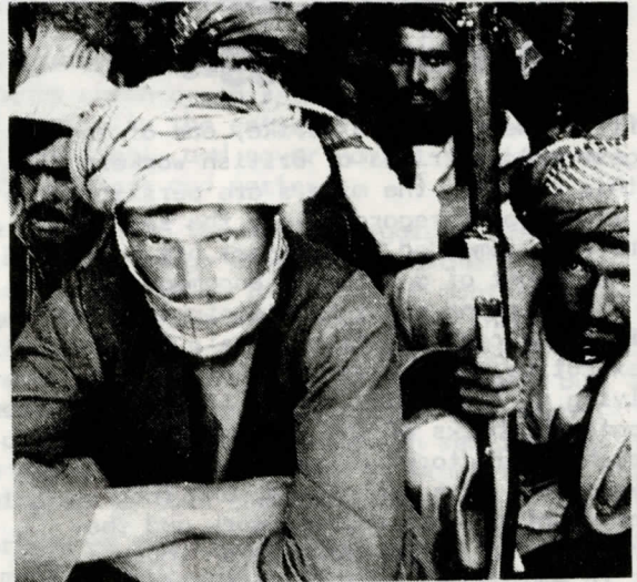
AFGHAN PATRIOTIC FIGHTERS

The criminal acts of the Soviet occupiers and their puppets will never be able to liquidate the liberation struggle of the Afghan people. For thousands of years the Afghan people have fought arms in hand against numerous foreign invaders who sought to put this strategic crossroads of Asia under their control, and they have never been conquered militarily. This will also be the fate of the Soviet occupiers. Thus, despite, recent troops re-inforcements which raised the number of Soviet occupation troops in that country to 115,000, the news agencies report the failure of another Soviet mopping-up operation in an attempt to gain control of the strategic Panjshir Valley on the road linking the capital of the country with the Soviet border. Fighting continued for ten days on end, and the Afghan patriots inflicted heavy