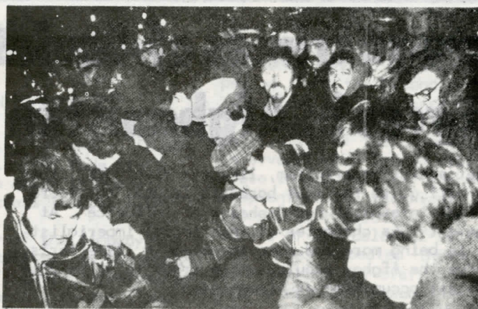
Militant mass picket by miners at Nantgarw colliery in South Wales on November 12.

As the strike has progressed the monopoly capitalist government, presently wielded by Thatcher and the Conservative Party, has steadily heaped on the burden of anti-worker Trade