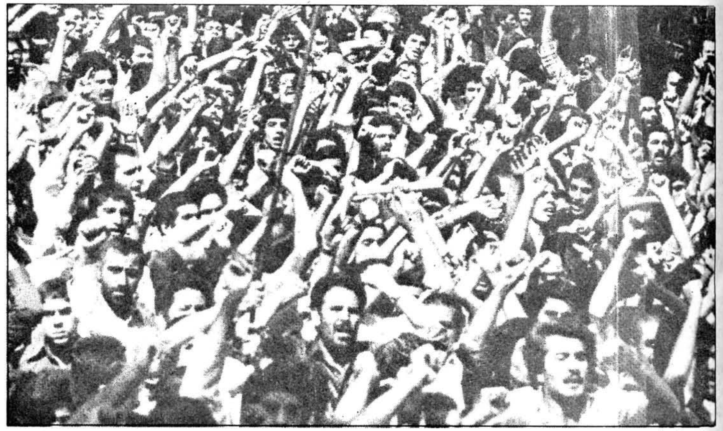
Demonstrations like this one in Tehran in September 1978 led to the overthrow of the fascist Shah's US-backed regime.

The traitor regime of the Shah, in order to guard the interests of its foreign masters, and with their help, is engaged in its daily effort of equipping its anti-people armed forces with sophisticated weaponry, the armed forces which has no duty other than the repression of the struggle of our people, and the peoples of the region. For this reason, the toiling masses of our people, in order to overthrow the Shah's regime, have no choice other than destroying