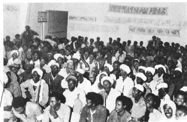
The 1st congress of the AEP in session. The slogan in the rear reads "The People's Militia is born in struggle."

the deliberations of the congress were conducted with active participation of the delegates.