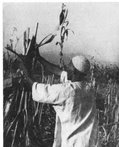
The peasant masses are increasing production in order to raise their standard of living and support their revolution.

peasants have strengthened their unity, in order to reinforce their struggle against the colonial and feudo-capitalist order and against the backward feudal culture and customs.