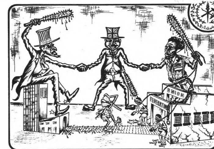
An EPLF poster depicting the crimes committed against the Eritrean people in the UN in 1950.

The so-called federation was a "cloak for the imperialist design of the colonial powers of Eritrea." (Ukrainian Soviet Socialist Republic). Ignoring the Eritrean people's aspiration for national independence the imperialists conspired to annex Eritrea to their neo-colony Ethiopia in order to satisfy their imperialist greed. Eritrea was to become "an autonomous state federated with Ethiopia under the sovereignty of the Ethiopian crown." This sham federation was not a federation between two equal states on a voluntary basis but the forcible annexation of Eritrea to Ethiopia. In implementing this imperialist conspiracy the very charter of the body, the UN that passed this unjust verdict was even violated, i.e.