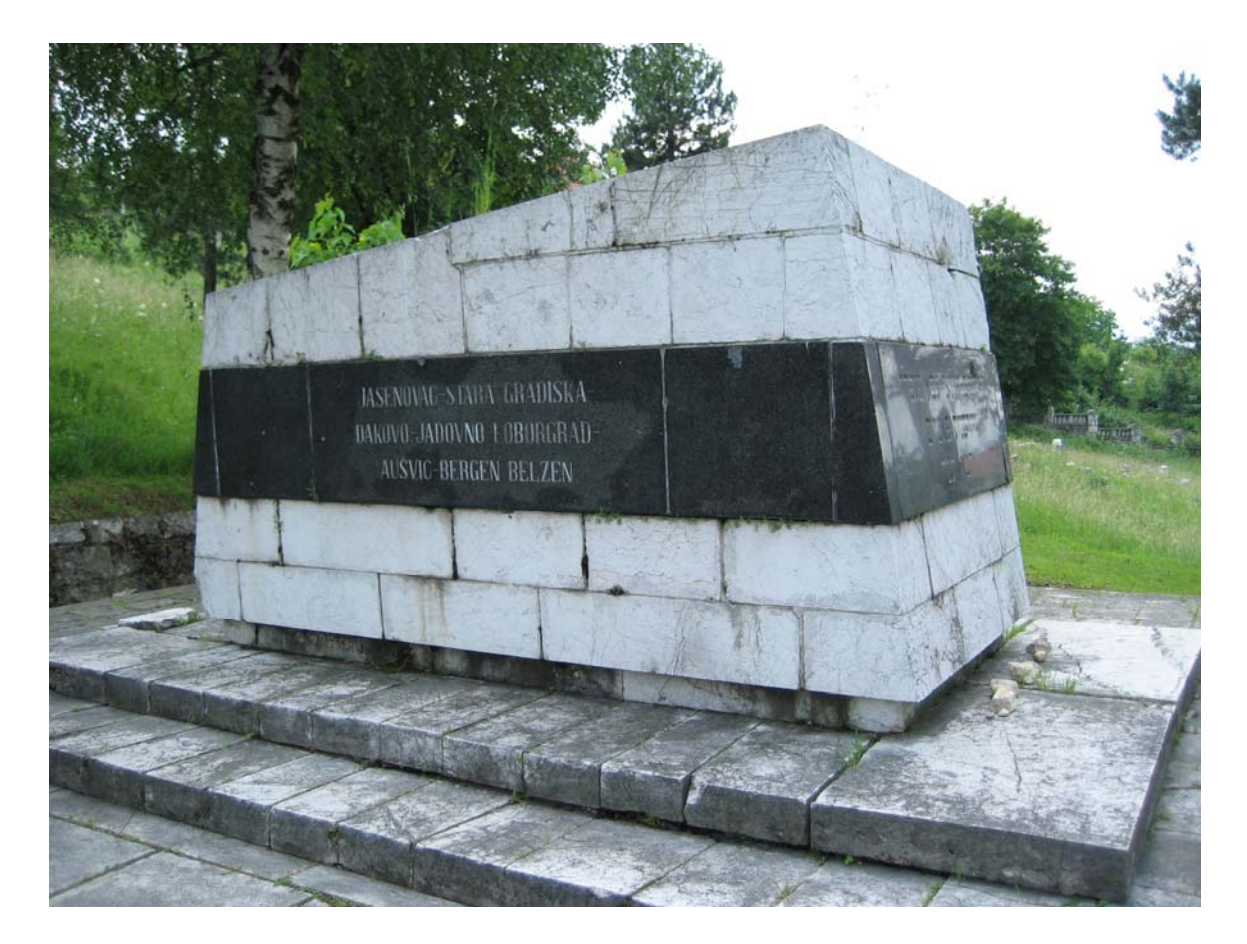
Fig. 6.9. The monument in Sarajevo. The inscription lists camps and execution sites in NDH (Jasenovac, Stara Gradiška, Đakovo, Jadovno, Loborgrad) and in Nazi Germany and occupied territories (Auschwitz, Bergen Belsen) (Photo: Emil Kerenji, 2006).