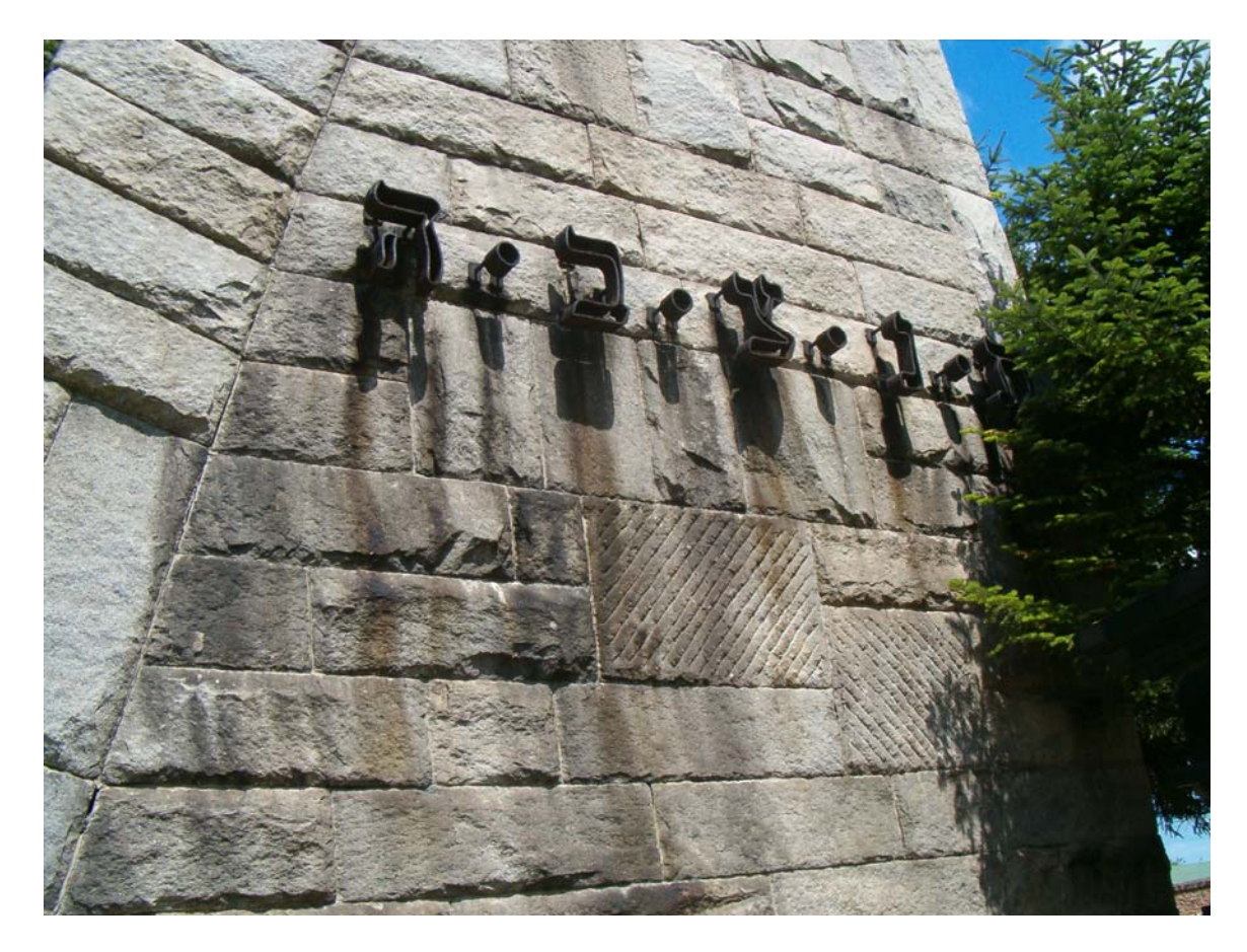
Fig. 6.5. The monument in Belgrade, detail. The Hebrew acronym is usually translated as "may his soul be bound in the bonds of eternal life" (Photo: Emil Kerenji, 2006).