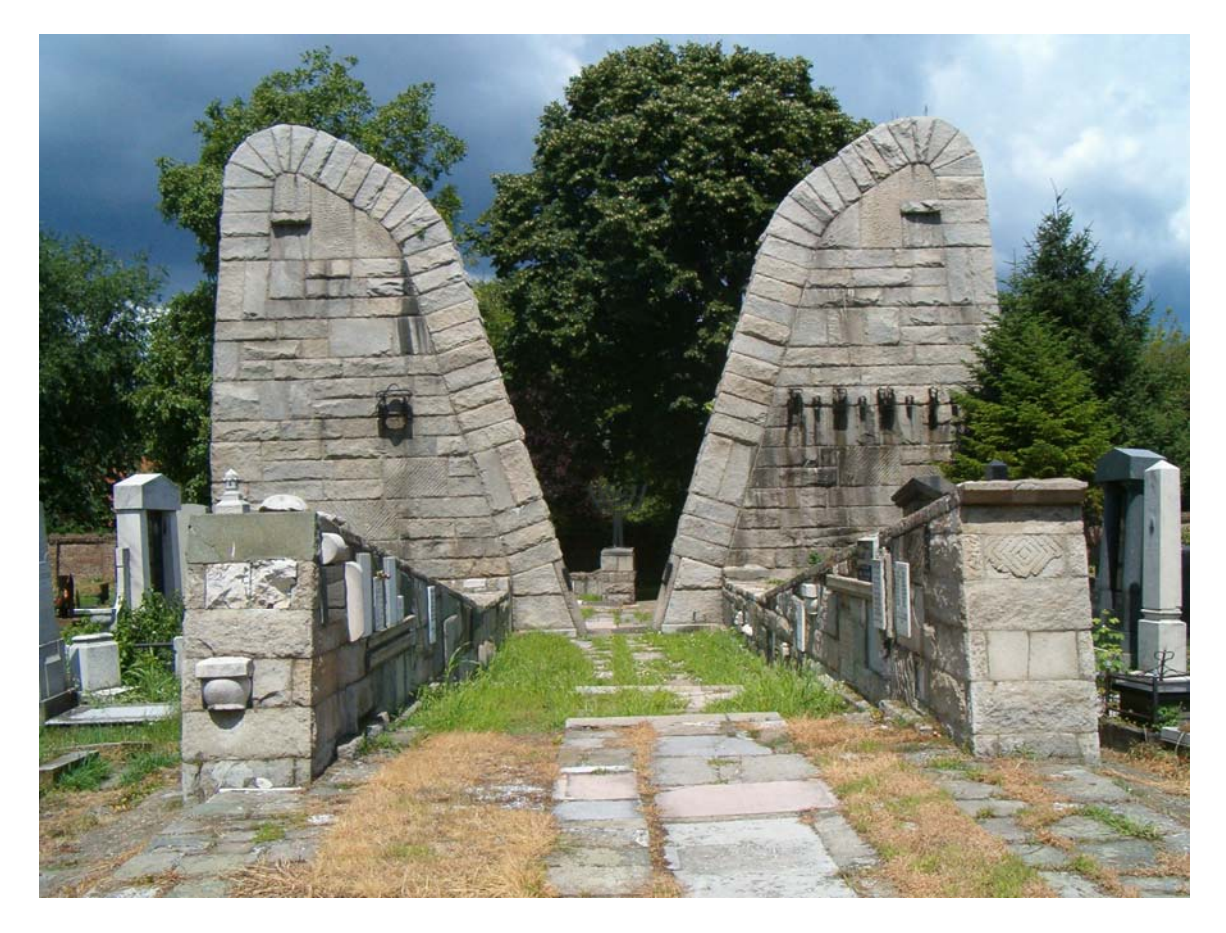
Fig. 6.2. The monument in Belgrade today. The plaques with individual names of victims were added subsequently, starting in the 1980s.