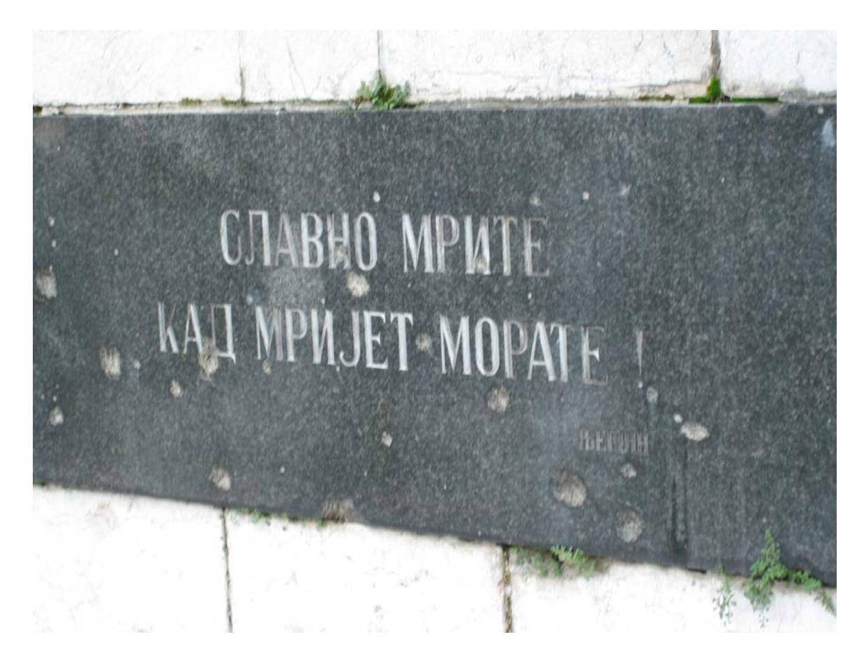
Fig. 6.12. The monument in Sarajevo today, damaged by shrapnel. The inscription is a quotation from Gorski vijenac by Petar Petrović Njegoš, and reads: "Die in glory if you have to die!".