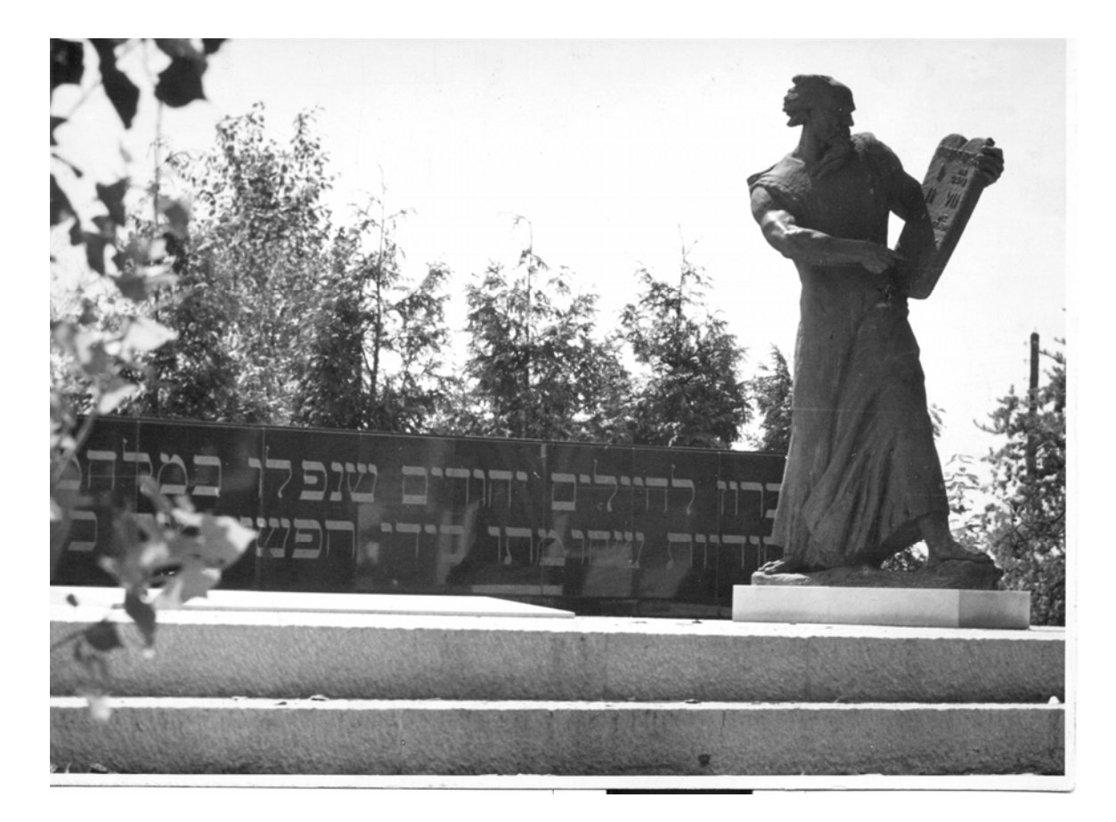
Fig. 6.6. The monument in Zagreb, circa 1952 (Photo courtesy of the Jewish Historical Museum, Belgrade).