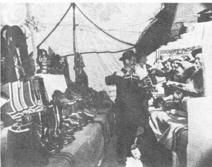
Buying boots at a Lhasa fair.

In their spacious sitting room, his wife treated me to highland barley wine and other Tibet-