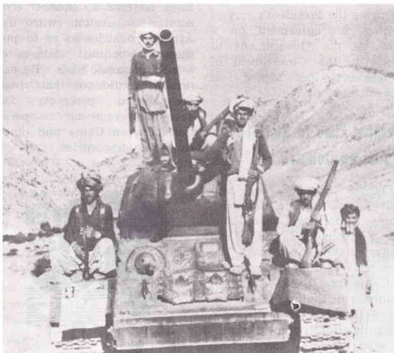
Soviet tank captured by Afghan guerrillas.

This Soviet scheme was immediately exposed and rejected by the representatives of many countries who pointed out that the prerequisite and only correct way to any political settlement is the immediate withdrawal of Soviet troops from Afghanistan. The Afghan people, they argued, must be allowed to exercise their right to self-determination without