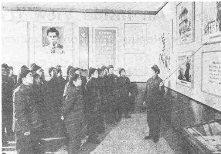
Chinese medical workers at the Kotnis Memorial Hall in Shijiazhuang

the Party. He shook my hand long and hard when I assured him that I would be honoured to do so.