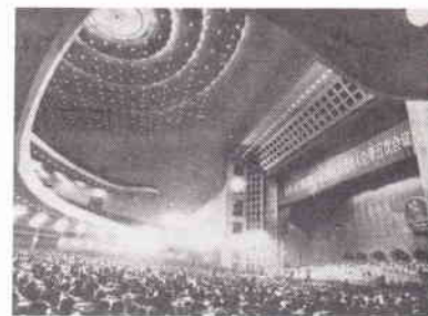
The NPC meeting hall.

In the 4th of a series of five articles, our correspondent gives a report on carpet making in Gyangze, a city known as Tibet's carpet centre (p. 28).