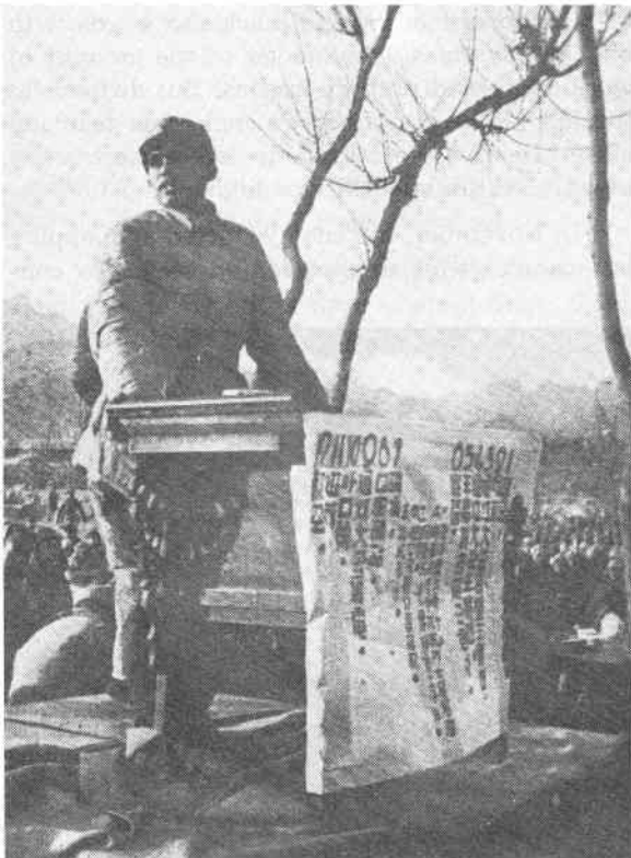
Addressing an anti-Japanese rally in the Shanxi-Chahar-Hebei border area.

After the meeting we sat together face to face. He still could not calm down. I lighted a cigarette and poured a glass of water for him. After a while he regained his composure and told me that the longer he stayed in China, the