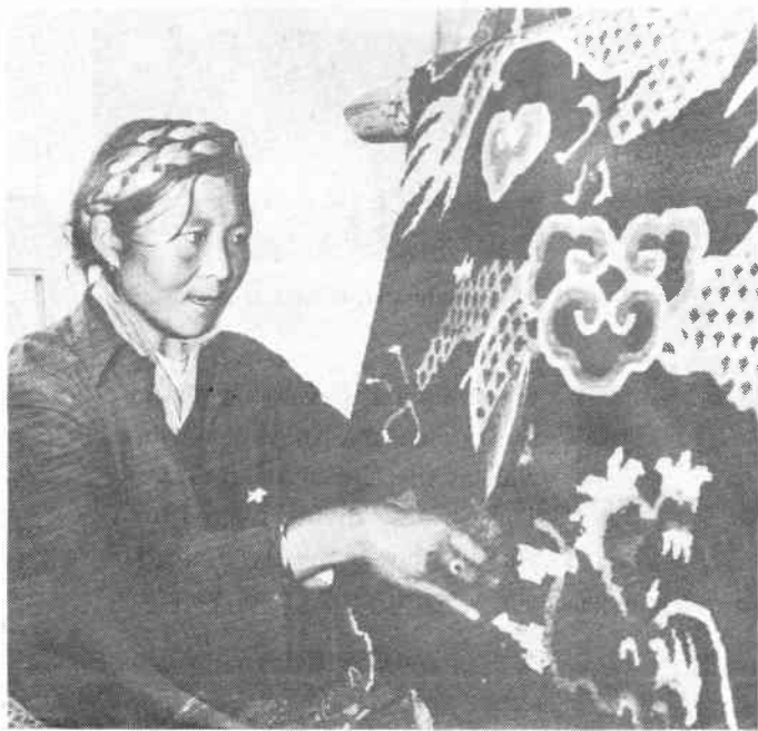
Trimming a carpet.

"The Democratic Reform Saved Me." The People's Liberation Army quelled the rebellion staged by some members of the upper social strata in 1959, and democratic reform was instituted in Tibet. The reactionary rule of the