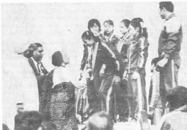
Prime Minister Indira Gandhi giving medals to China's women gymnasts.

the skills and developed distinctive styles and they performed well at the Ninth Asian Games. The Chinese diving team which was composed mostly of teenagers, with only two veterans