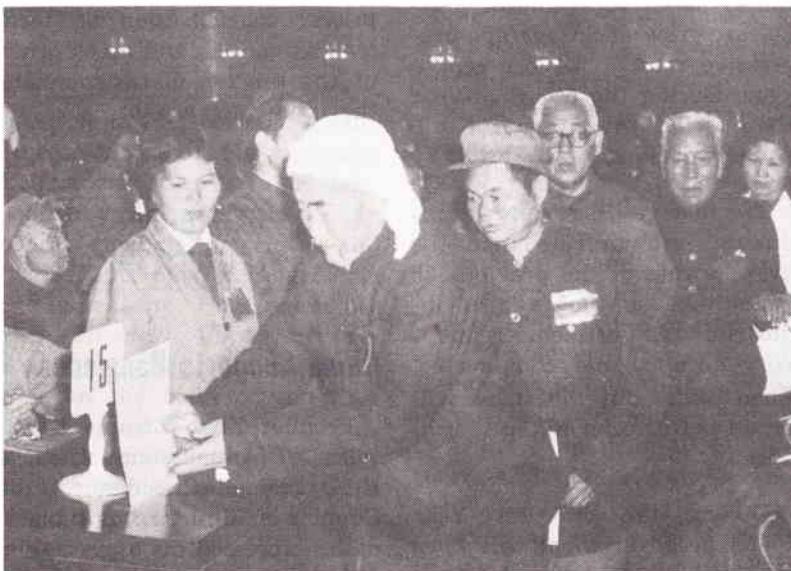
Deputies casting ballots on the new Constitution.

The meeting also passed a resolution to restore the original