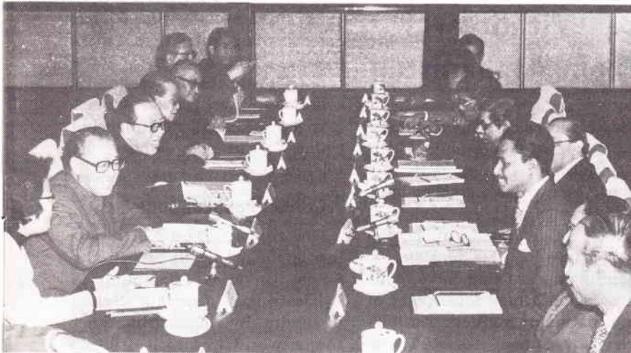
Premier Zhao Ziyang and President H.M. Ershad hold talks.

operation in South Asia. He also expressed the hope that countries in South Asia, big or small, will treat each other as equals, live in friendliness and develop regional co-operation. This is conducive not only to the social development of these countries but also to peace and stability in that region.