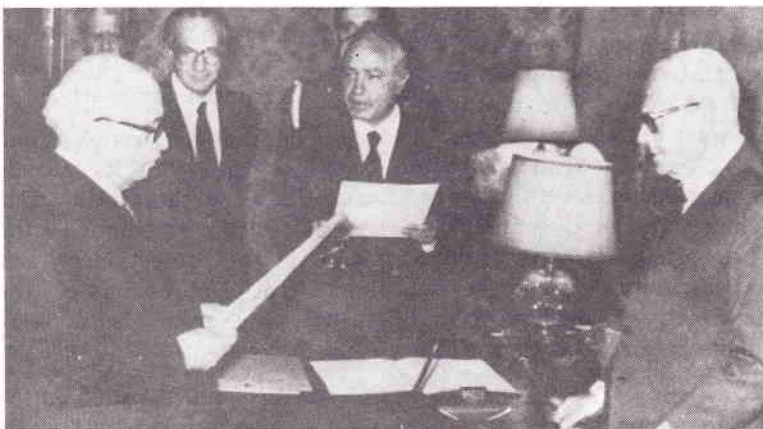
Prime Minister Fanfani (left) takes the oath of office.