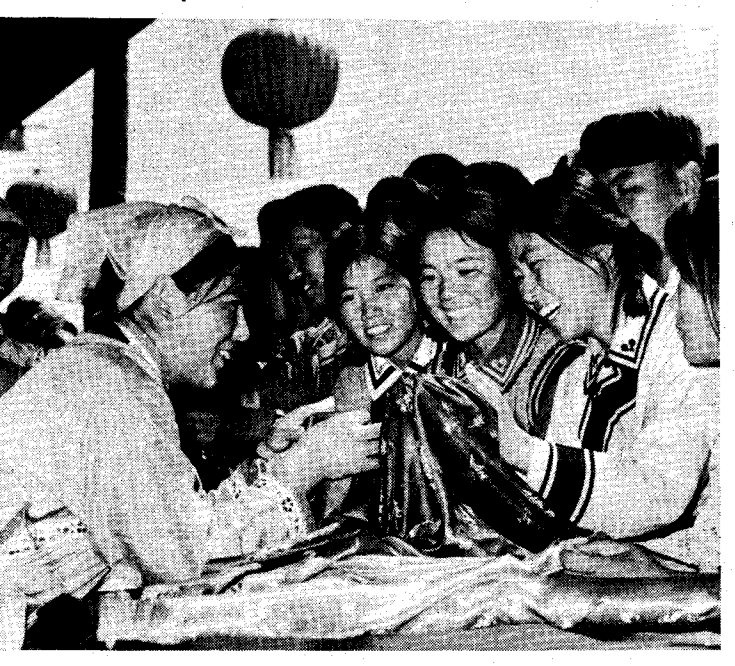
Mongolian nationality herdswomen shopping.

I have been living by myself these years, but I never feel lonely. My livelihood is secure. Young people don't treat us old people with disdain. No one has forgotten us either. I try to hold up my end by being useful to society. I began to learn how to read and write when