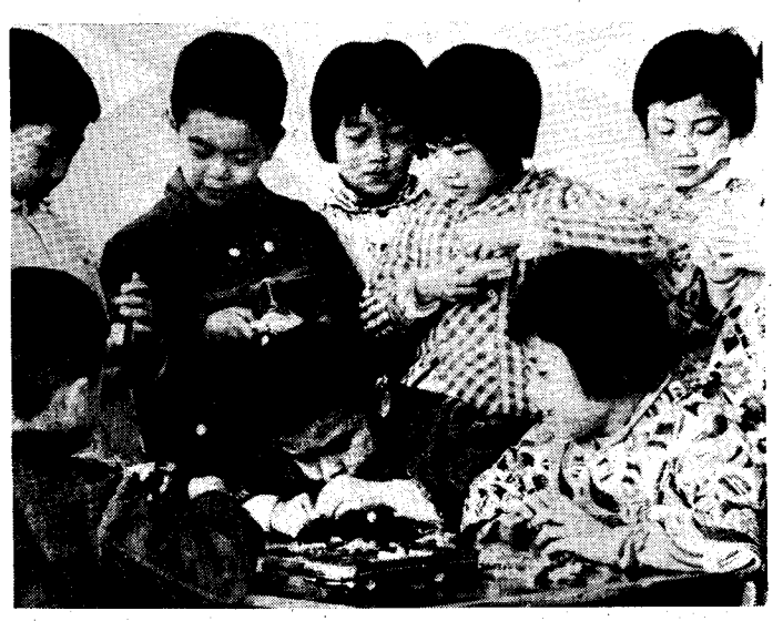
Beijing No. 1 Cotton Mill kindergarteners.

Contraceptives, sterilization and induced abortion are free all over the country. There is