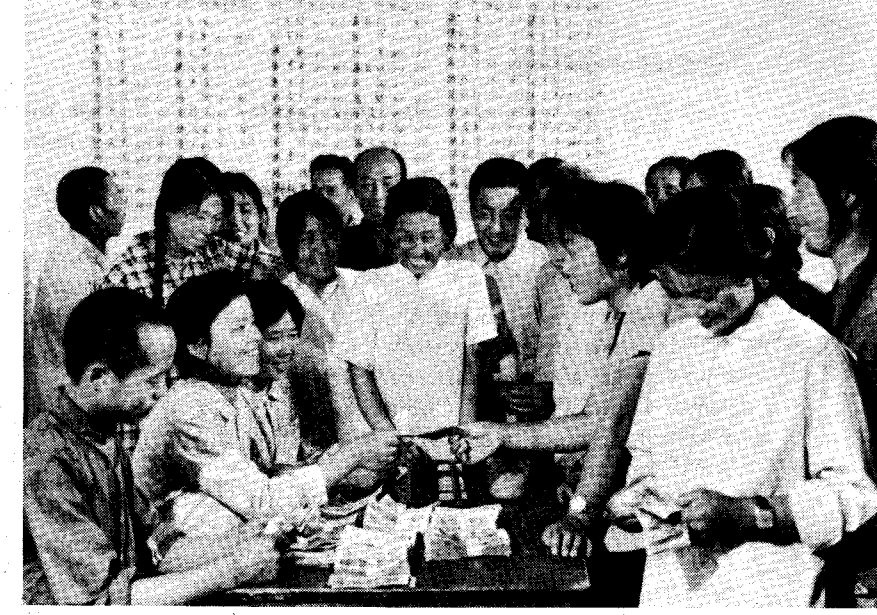
Women members of a Hebei people's commune getting their pay.

In recent years, women have also started to learn other types of highly skilled work which was done exclusively by men before, such as scattering seeds, building houses and driving horse-carts. . . . Women made up 70 per cent