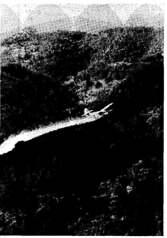
Aerial spraying against insect pests in Guangxi.

Over 10 million hectares of barren land and mountain slopes in China were sown from the air. Saplings have appeared on 2.7 million hectares and mature trees on 1.5 million hectares.