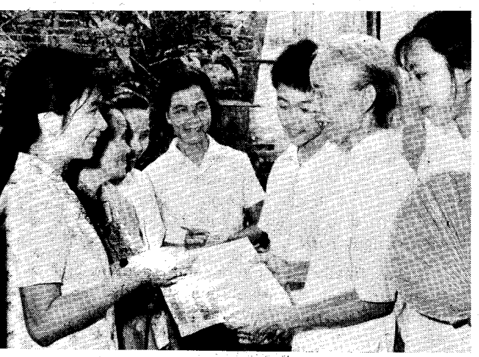
An elderly woman in Foshan, Guangdong, gets citation for good housekeeping.

Those of us on the neighbourhood committee felt that the job of bringing up youngsters can't just be left to the schools and parents. We had to help too. So we set up many cultural centres where 900 retired workers, teachers and scientific and technical personnel help children with their lessons. This had a good effect on most of their studies.