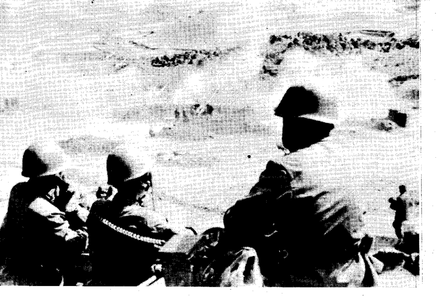
Shelling Vietnamese aggressors.

Vietnamese inhabitants in Thong Nong, Ha Guang, Ban Lao and Bat Sat Districts told Chinese border troops that they were only given enough grain rations to last for a few months of the year because the Vietnamese authorities, bent on expanding their military might, paid no heed to the people's well-being.