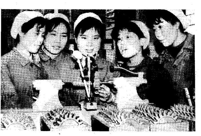
Inspecting products in the Beijing Instruments Factory.

said that two women workers were secretly used to replace one man worker in some factories. This kind of phenomenon no longer exists. But the leadership in certain plants usually assigns women workers to service or auxiliary jobs, paying no heed to their studies of techniques.