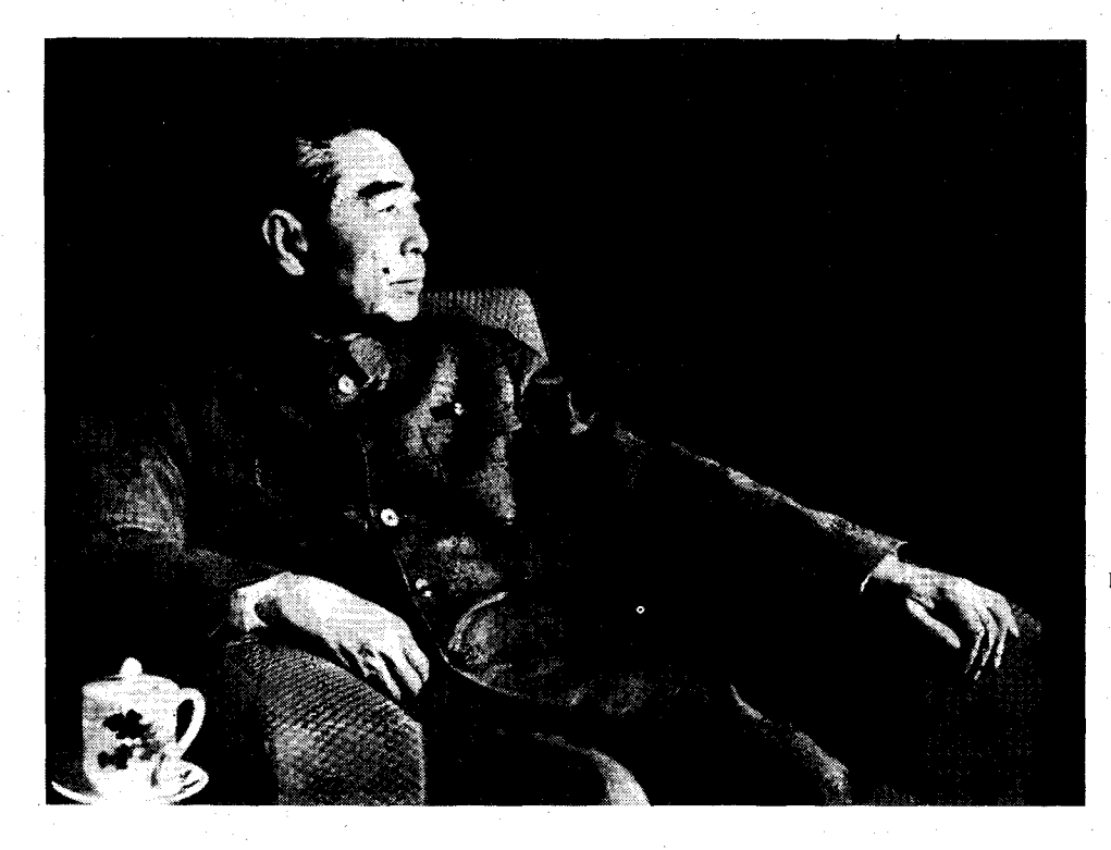
Premier Zhou Enlai. by Giorgi Lotti, Italian photographer (1973)

April 1976 which captured nationwide and, indeed, worldwide attention was truly a mammoth revolutionary mass movement launched by the Chinese people to defend Comrade Zhou Enlai and denounce the "gang of four." For he was the man who had stood firmly in the way of the "gang of four" trying to usurp the supreme leadership of the Party and state. When Comrade Zhou Enlai was alive, the gang had maliciously tried to defame him; after his death, the gang had forbidden the nation to mourn him. This perversive behaviour of the "gang of four" had provoked the whole nation to utmost indignation. The mighty masses roared and their anger burst out like an erupting volcano. In front of Tian An Men, at the foot of the Monument to the People's Heroes, the sons and daughters of the Chinese nation demonstrated their love with wreaths and their hatred in acrimonious poems, delivered their historic verdict which sounded the knell for the "gang of four" and provided the ideological and mass basis for the victory of the October struggle led by the Party Central Committee with Comrade Hua Guofeng at its head.