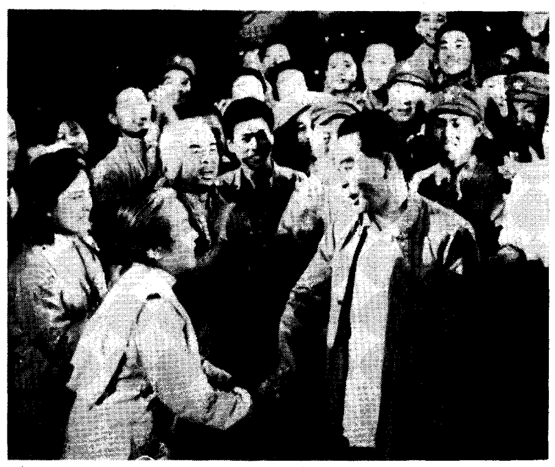
A scene from the picture: Premier Zhou arrives at the dyke.

The second half of the film deals with changes in the flood area after the founding of the People's Republic. Here, for the