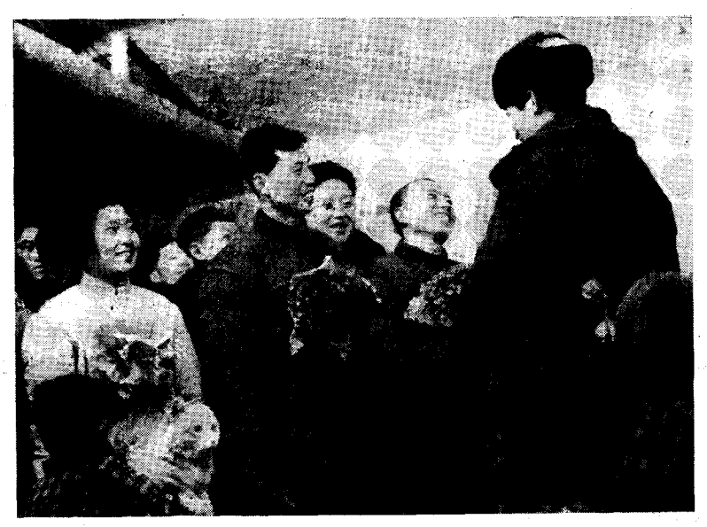
Party branch secretary of a production brigade in Heilongjiang Province congratulating two brothers and their sister from a landlord family for having been cited as labour models.

The landlords were the target of the democratic revolution in China. Before liberation in 1949, they oppressed and exploited the peasants and constituted a pillar of reactionary regimes. The landlord class was overthrown as a result of the land reform carried out in all parts of the country before and