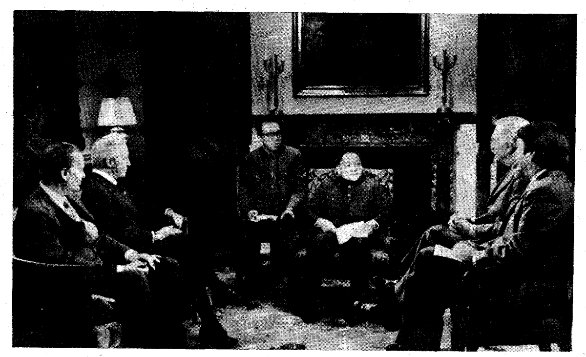
Vice-Premier Deng interviewed by U.S. TV commentators.

in Iran. The strategic position of Iran is extremely important. As for China, we can only morally express our points of view. We cannot do very much because of lack of ability there. And I believe that those countries who are in a position to do more should adopt a very serious attitude toward the question of Iran, and adopt more effective measures to help bring about a solution of the problem there.