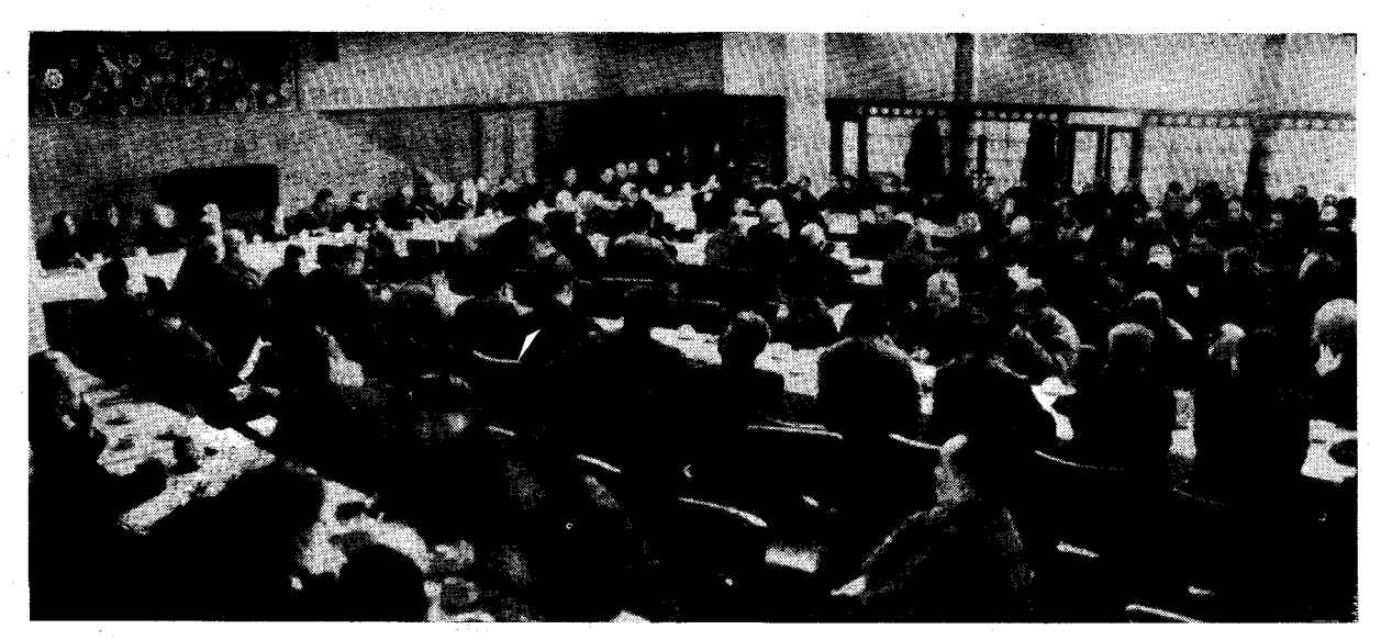
At the meeting called by the Department of United Front Work.

"... patriotic capitalists and other patriotic democrats... under our people's democratic dictatorship, they all belong to the category of the people." (Talk at an Enlarged Working Conference Convened by the Central Committee of the Communist Party of China, 1962.) It is imperative to continue doing what Comrade Mao Zedong taught us, completely renounce and discredit the counter-revolutionary line of Lin Biao and the "gang of four," get rid of its pernicious influence and reverse the false charges made against patriotic personages and members of the national bourgeoisie.