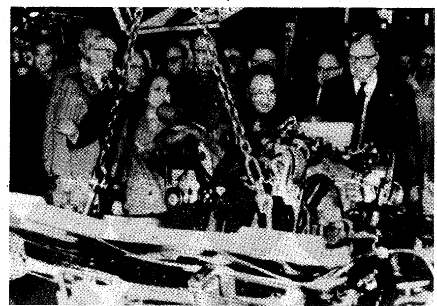
At a Ford assembly line in Atlanta.

consideration for the Soviet Union, Carter did not use phrases to Deng's agreeing whole speech, but the United States and China have arrived at a completely identical view on the strategy of co-operating to deal with the expanding military of Soviet strength." The correspondent said that the "common understanding reached between China and the United States will exert a tremendous influence