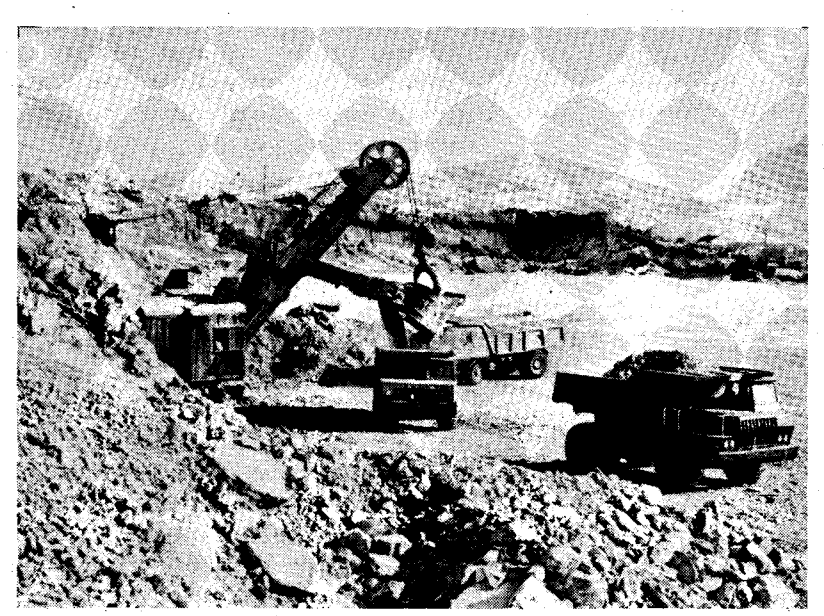
Gongchangling Iron Mine, Anshan.

Last October the Shanghai paper Jiefang Ribao advertised that the Shanghai No. 3 Steel