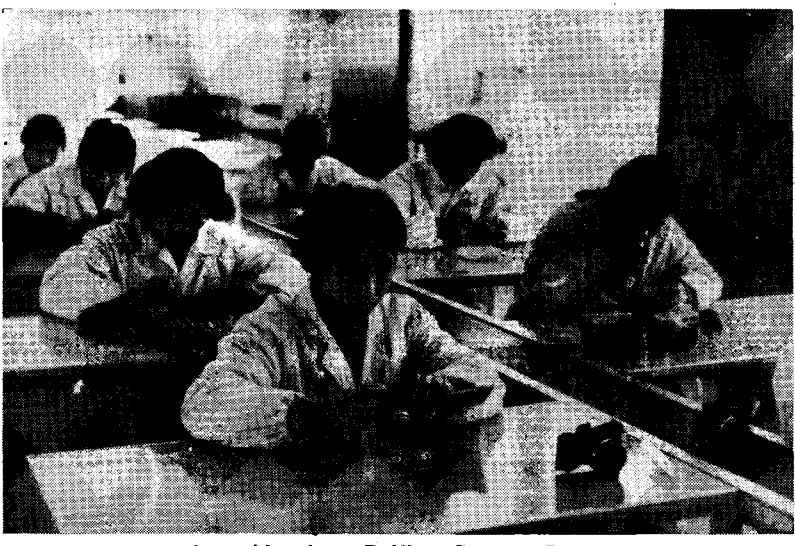
Assembly shop, Beijing Camera Factory.

Telemetric geological centres will be set up in both north and