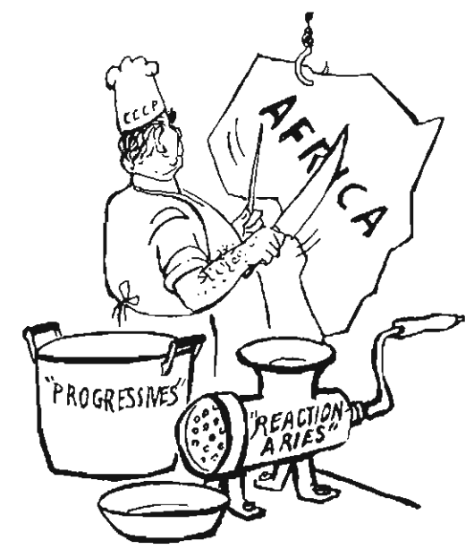
Divide and consume.

Mercenaries as Spearhead. One move the Soviet expansionists employ most in Africa is