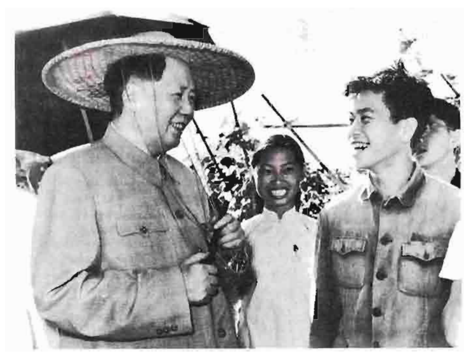
Chairman Mao on an inspection tour of Guangzhou's outskirts in 1958.

and were left half-destitute and driven to rebel, the poor peasants and farm labourers would be isolated. Some people ridiculed my approach as a rich-peasant line, yet I'm afraid my measures were the only correct ones at the time. Of course, today we have the Anti-Japanese National United Front and we are reducing rent and interest, not depriving the landlords and rich peasants of their property rights. Otherwise, it would be impossible for us to unite with them in the fight against Japan.