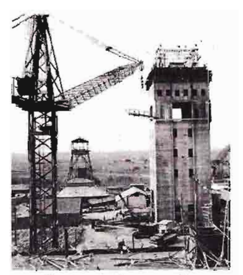
Yanzhou Colliery: Another big shaft under construction.

fiery, arid oasis) to Korla County through the Tianshan Mountains. The terrain is rugged and ravine-slashed, so many tunnels had to be bored and bridges built.