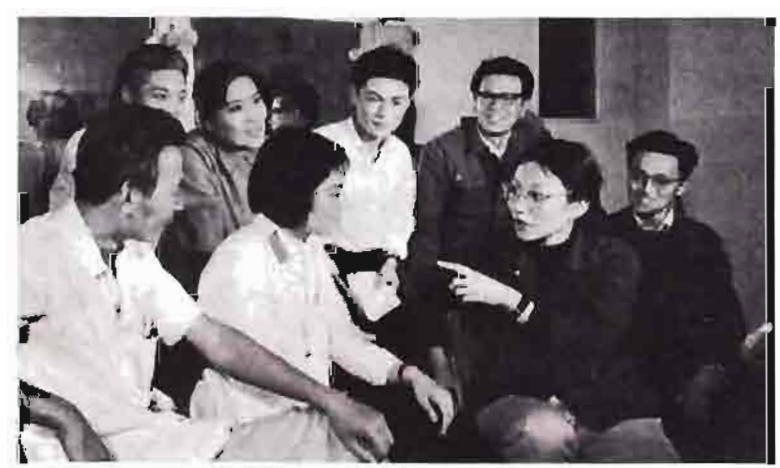
Playwright and director with the actors.

When the draft was finished, the amateur playwright solicited and received encouragement and help from all quarters. Improvements were introduced continuously during rehearsals, and even after it had been actually presented on stage. In his own words, "This play is the result of collective efforts." This, incidentally, shows a tiny