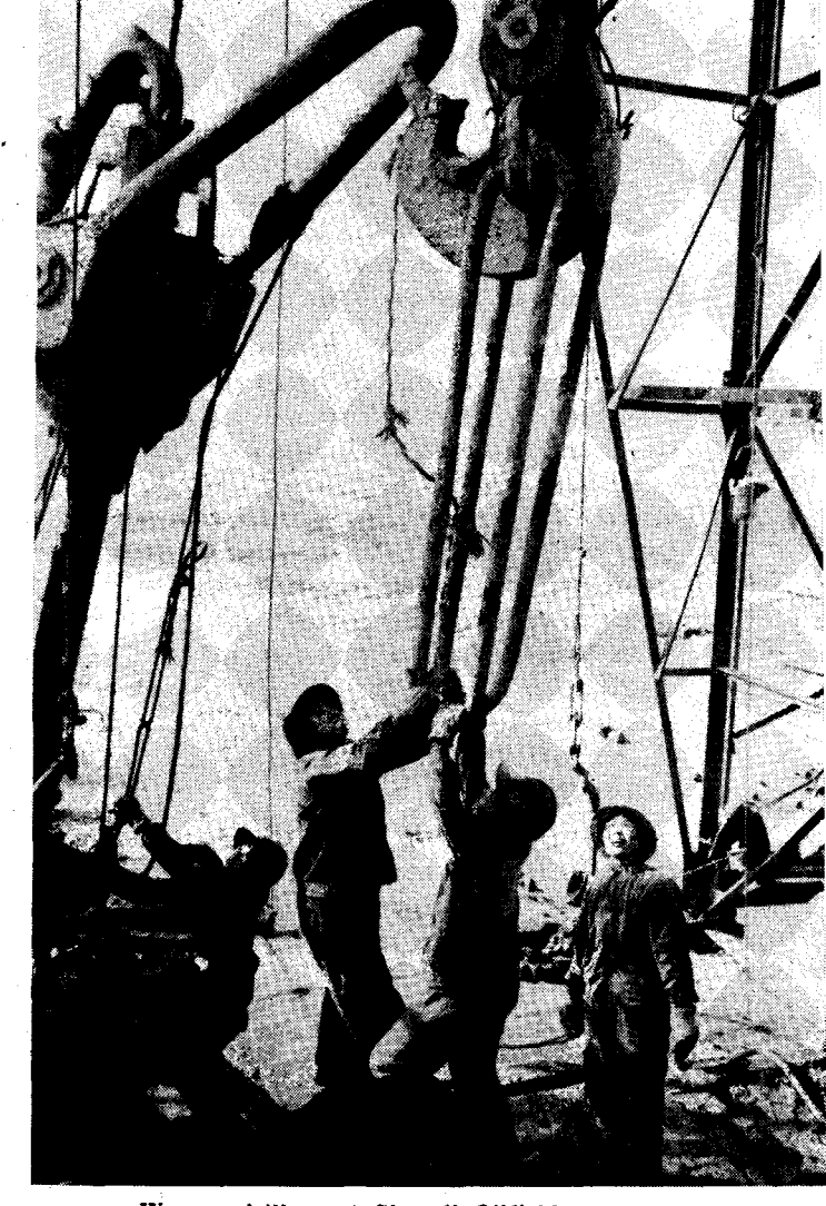
Women drillers at Shengli Oilfield.

Some major issues of right and wrong which were confused by the gang have also been gradually clarified. One example of this is the question of how to properly assess the situation in industry, communications and transport before the start of the Cultural Revolution. To usurp Party and state power, the gang went out of its way to whip up a campaign to suspect and negate everything, and to paint a dark picture everywhere of the work done in the 17 years between the founding of the People's