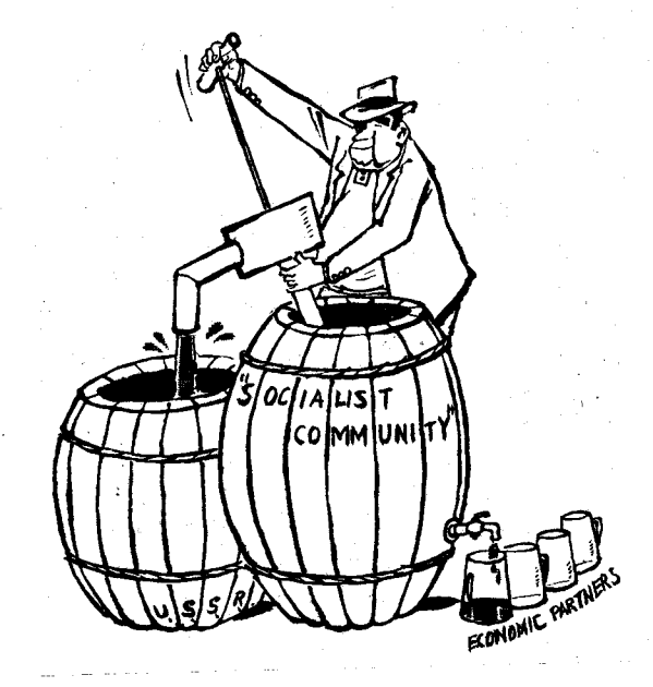
bigger share than others. by Hsu Chin

In an editorial, the Malaysian paper Nanyang Siang Pau on July 1 said that as a member of the Soviet bloc, Viet Nam "will bring new problems of security and stability to Southeast Asia and Asia as a whole."