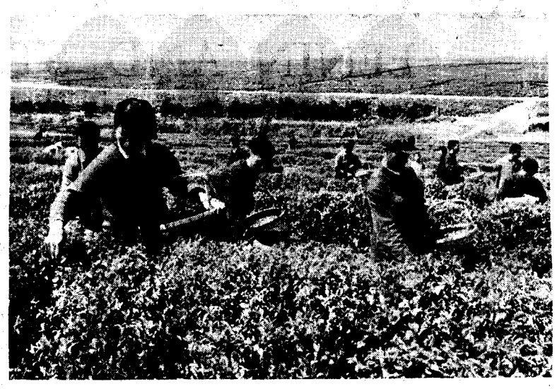
Picking spring tea.

Meat bones recovered from restaurants and residents are