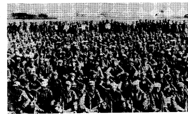
Part of the Red Army which reached northern Shensi after the Long March.

After occupying China's three northeastern provinces in 1931, the Japanese imperialists stepped up their activities to annex the whole of China. The fate of the Chinese nation hung by a thread.