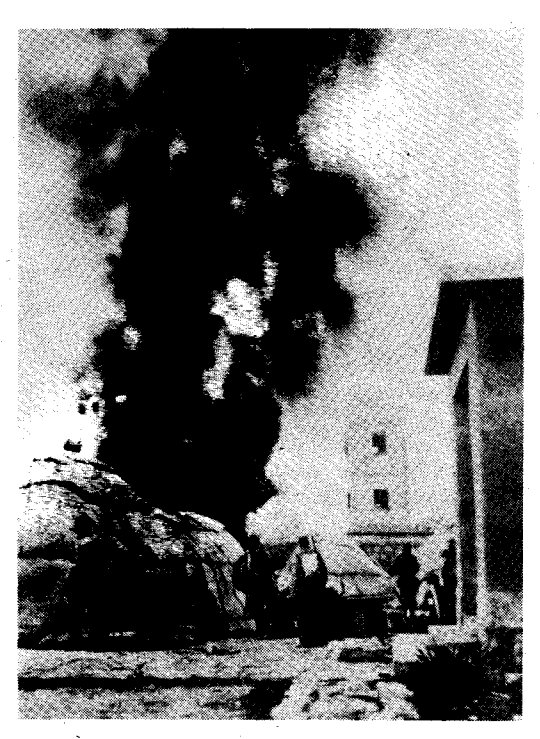
The New Fourth Army taking Chenchiakang, an important town in northern Kiangsu Province.

of arduous struggle, finally smashed the Japanese invaders' "full-scale war" and beat back the Kuomintang's second anti-Communist onslaught, thereby tiding over the difficulties, tempering itself and improving its combat effectiveness.