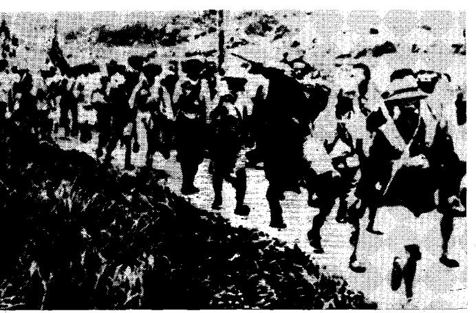
The Workers' and Peasants' Red Army during the period of struggle against enemy "encirclement and suppression" campaigns.

as general political commissar and Comrade Chu Teh commander-in-chief. The Red Army units in the Hupeh-Honan-Anhwei Base Area were reorganized into the Fourth Front Army of the Red Army and those in other base areas were reorganized either into armies or army corps.