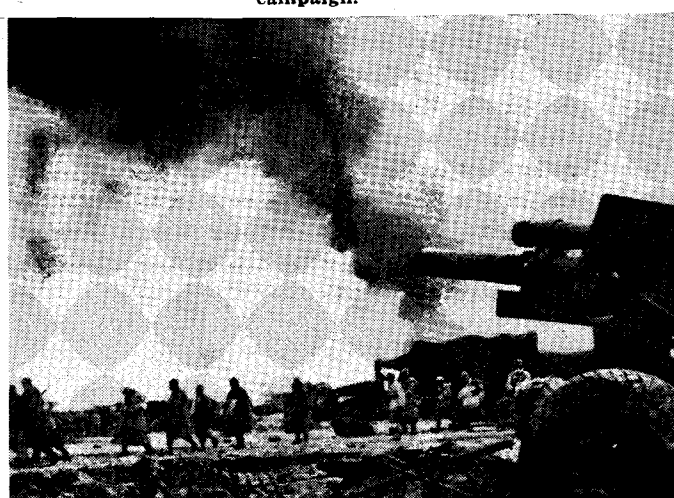
Kuomintang troops captured in the Huai-Hai campaign.

From the autumn of 1947 to the spring of 1948, under the leadership of Chairman Mao and the Party Central Committee, our army units conducted between battles a new type of ideological education movement by the methods of "pouring out grievances" about their suffering under reactionary rule and of the "three check-ups" (on class origin, performance of duty and will to fight), thus further expanding democracy in the three main fields - political, economic and military. Chairman Mao spoke highly of this. He said: "Through the new type of ideological education movement in the army by the methods of 'pouring out grievances' and of the 'three check-ups' the People's Liberation Army will make itself invincible." In October 1947, Chairman Mao reissued the Three Main Rules of Discipline and the Eight Points for Attention and in December the same year he summed up on a high plane the combat ex-