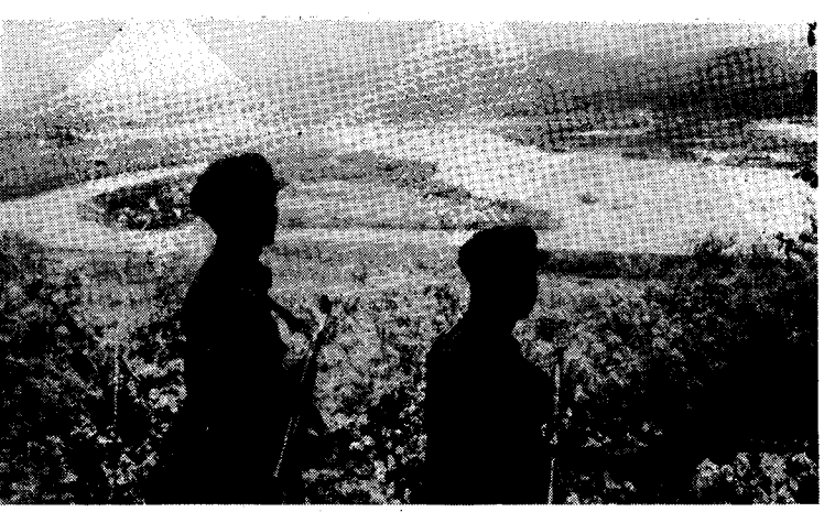
P.L.A. frontier guards defending the Chenpao Island area.

military and political training and carried out national defence construction projects and other work in preparedness against war.