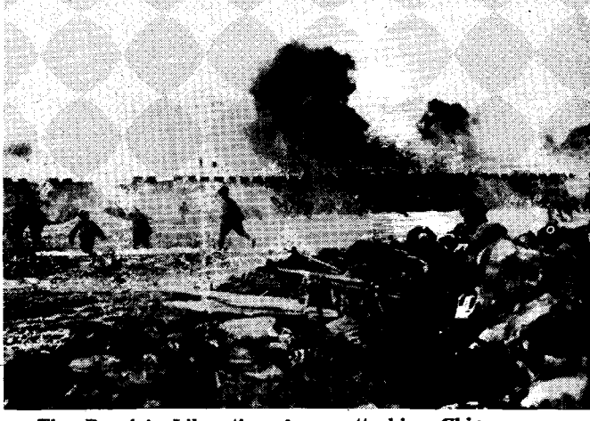
The People's Liberation Army attacking Chinchow during the Liaohsi-Shenyang campaign.

In July 1947 when the War of Liberation entered its second year, the Chinese People's Liberation Army went over from strategic defensive to strategic offensive on a nationwide scale.