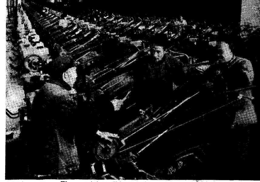
The county's walking tractor plant.

Chairman Mao pointed out: "The social and economic features of China will not be completely changed until the socialist transformation of the social and economic system is completely accomplished and, in the technical field, machinery is used in all possible branches and places." (On the Question of the Co-operative Transformation of Agriculture, 1955.)