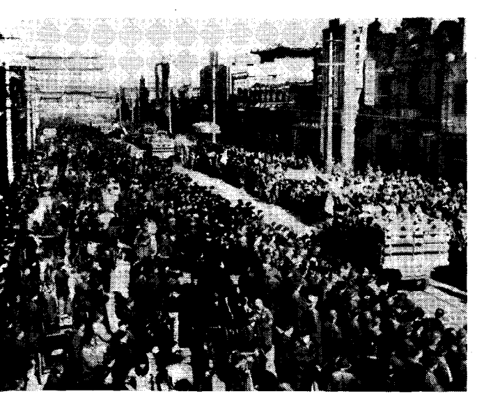
The People's Liberation Army entering Peiping (Peking) after the Peiping-Tientsin campaign.

perience of our army and advanced the famous Ten Major Principles of Operation.