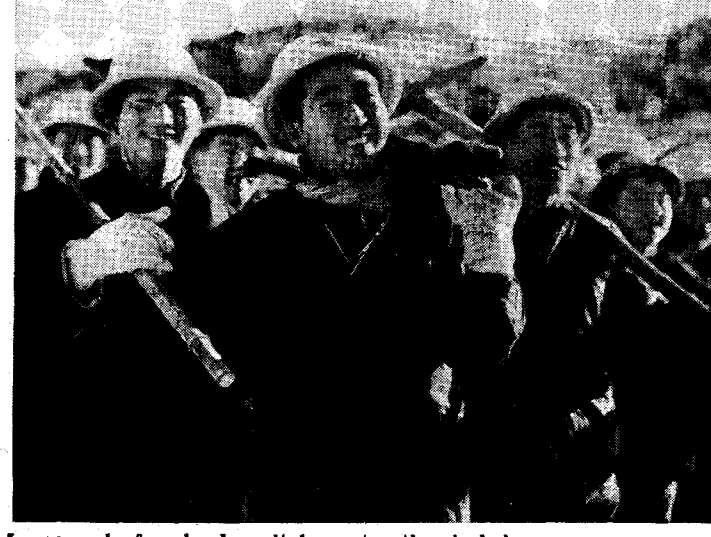
Large-scale farmland capital construction is being undertaken in Hsiyang County. Photo shows a specialized team on their way to work.

On the other hand, with the growth of the productive forces, it is necessary to make timely changes in those aspects of the relations of production that do not correspond to the development of the productive forces. We must pay attention to improving and adjusting the relations among people in the course of production, and adhere to the principle of "from each according to his ability, to each according to his work" and implement the Party's economic policies in the rural areas so as to put those things to rights which were turned upside down by the "gang of four." As regards the system of ownership, if we take the situation in most parts of China into consideration, the present