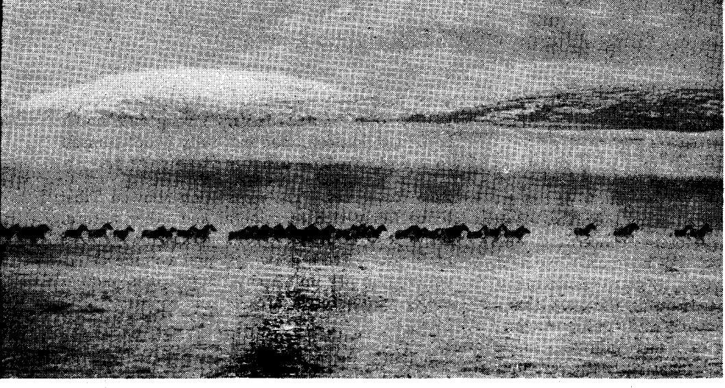
Wild donkeys in northern Tibet.

shown that the thickness of the earth's crust in this area is only about 48 kilometres while the crust in the vicinity of Lhasa where the mountains are not so high, is 70 kilometres thick.