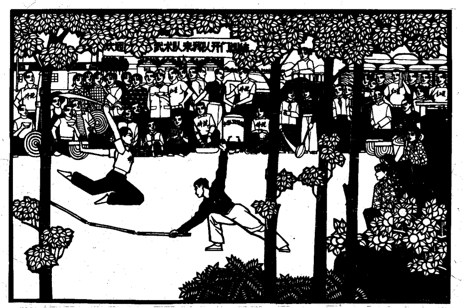
Performing wushu for the commune members.

Papercut by the Nantung Arts and Crafts Research Institute