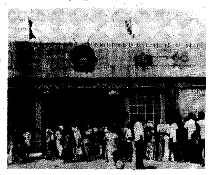
Some 110,000 people visited the two-week Chinese Economic and Trade Exhibition in Niamey, capital of Niger.