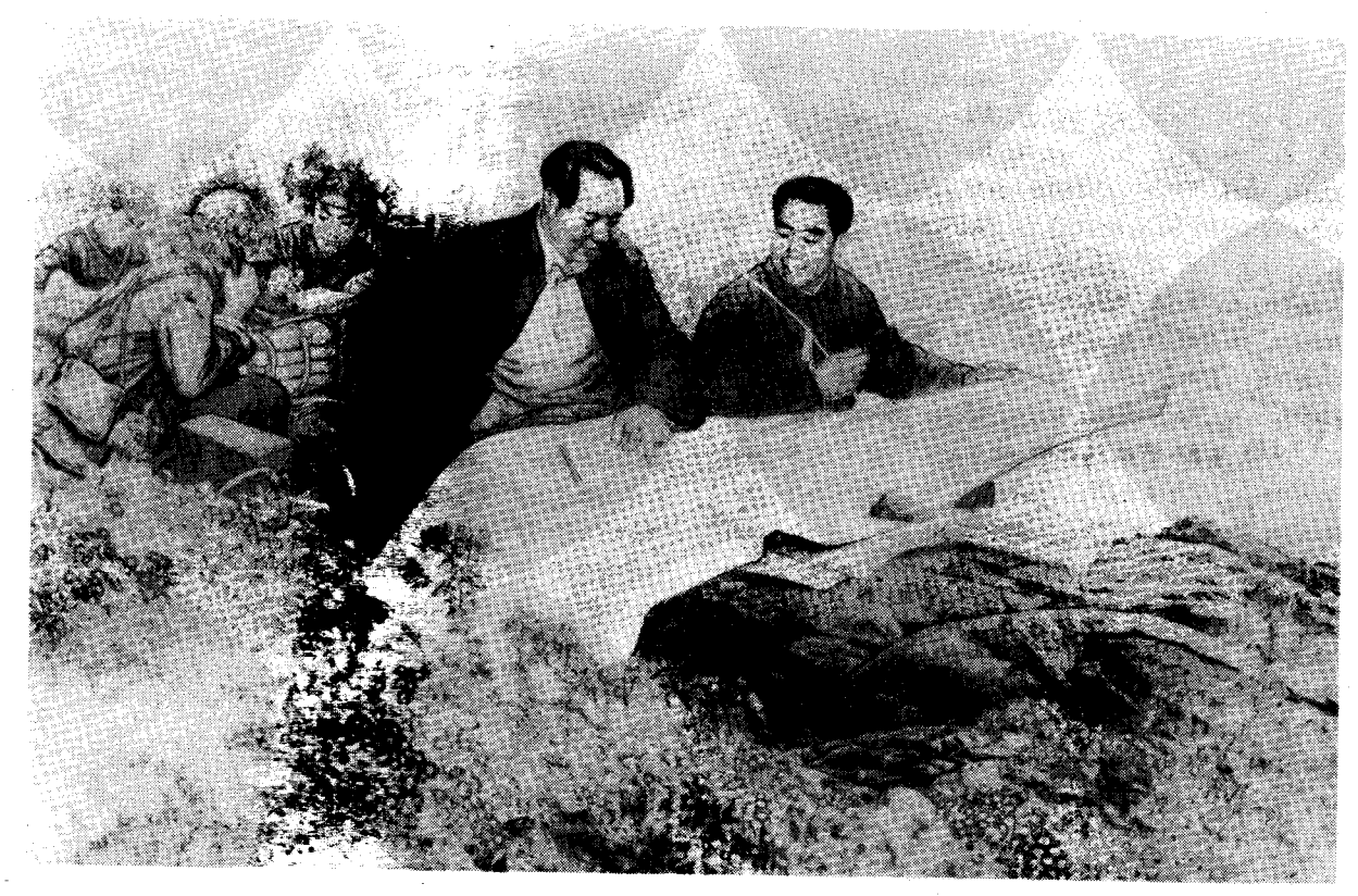
Working for the Interests of the People.