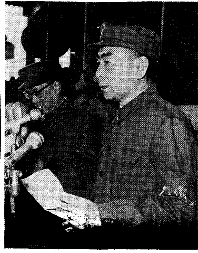
Premier Chou and Comrade Kang Sheng at a reception meeting with revolutionary teachers and students who had come to Peking from various parts of the country, September 1966.