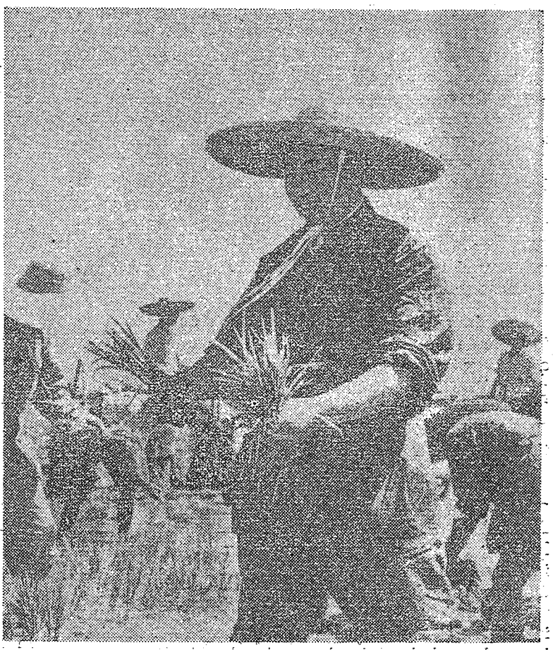
Comrade Hua Kuo-feng transplanting seedlings with commune members of a Hunan production brigade in 1970.

However, the anti-Party clique headed by Peng Teh-huai attacked the Party's general line for building socialism, the big leap forward and the people's communes in a vain attempt to overthrow the Party Central Committee headed by Chairman Mao. Comrade Hua Kuo-feng firmly defended and implemented Chairman Mao's revolutionary line and policies in this struggle. Citing the facts and information he had collected, he educated the cadres and masses on the need to distinguish the essence from the appearance of things, the main from the minor aspects, and not to confuse the minor and non-essential things with the major and essential ones so that they would not lose their bearings. Under his guidance, articles were written to warmly eulogize the great victories of the three red banners and tit-for-tat struggles were waged against the Right opportunist line pursued by. the Peng Teh-huai anti-Party clique. This won him Chairman Mao's confidence and praise. After the Peng Teh-huai anti-Party clique was smashed at the Lushan Meeting of the Party Central Committee in 1959, Chair-