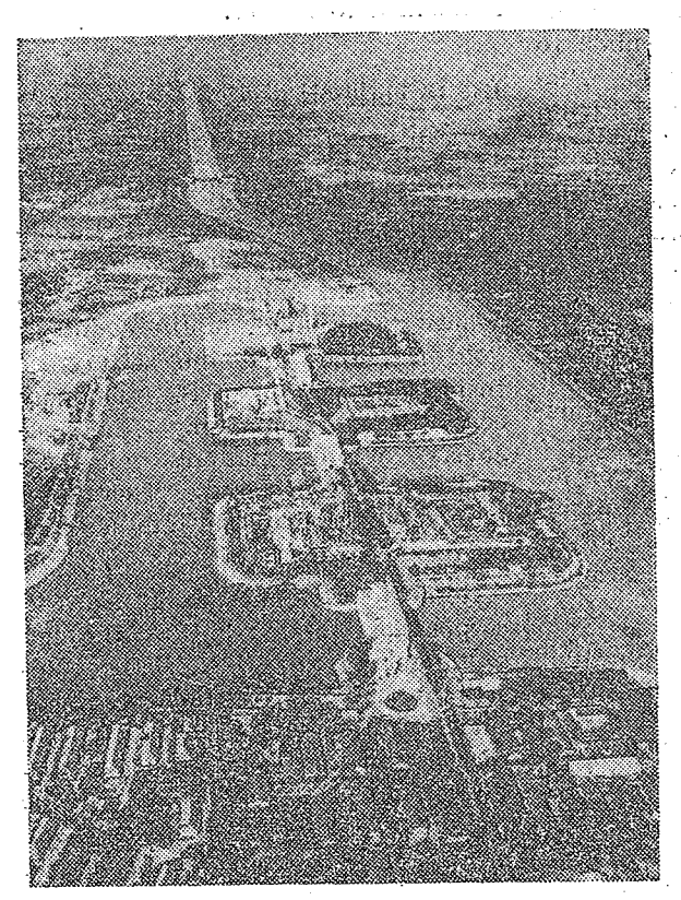
A bird's-eye view of the Chiangtu pumping station.

E NORMOUS achievements have been made in harnessing the Huai River by the people of Honan, Anhwei, Kiangsu and Shantung Provinces in the Huai River basin.