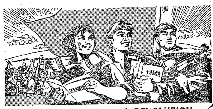
THE GREAT CULTURAL REVOLUTION WILL SHINE FOR EVER

I am determined to conscientiously study the series of important instructions from Chairman Mao, deepen the criticism of Teng Hsiao-ping's counterrevolutionary revisionist line and carry the great struggle to repulse the Right deviationist wind to reverse correct verdicts through to the end.