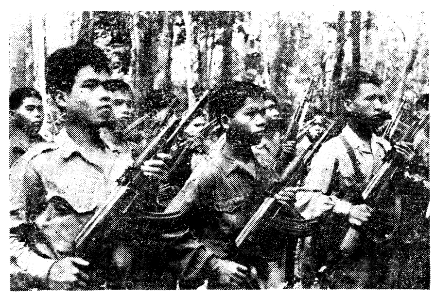
Fighters of the Cambodian People's National Liberation Armed Forces.

mocracy. Production in the liberated areas is developing quickly and the people's livelihood has improved. A thriving scene has appeared in the vast liberated areas which have become a strong base for the war against U.S. aggression and for national salvation.