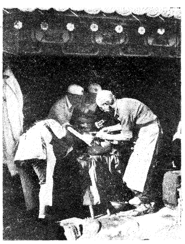
Norman Bethune—a proletarian internationalist fighter (photo). by Wu Yin-hsien

The set of five woodcuts Fighting in the High Mountains, collectively created by 18 cadres and soldiers of a unit of the P.L.A. Railway Corps, have depicted in a clear and lively way bridge-building scenes in a frontier region.