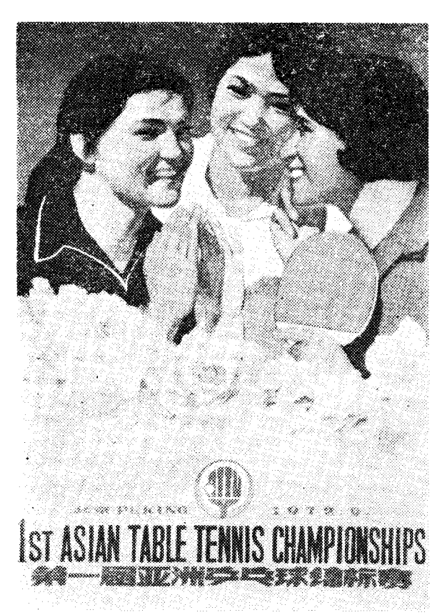
A poster for the 1st Asian Table Tennis Championships.

In May this year, delegations and delegates of table tennis associations from 16 countries and regions in Asia held a meeting in Peking to set up the A.T.T.U. Through democratic consultation and full discussion, they reached unanimous agreement on the establishment of a new and truly representative Asian table organization — the tennis Asian Table Tennis Union. The meeting also decided that the First Asian Table Tennis Championships be held in Peking from September 2 to 13, 1972.