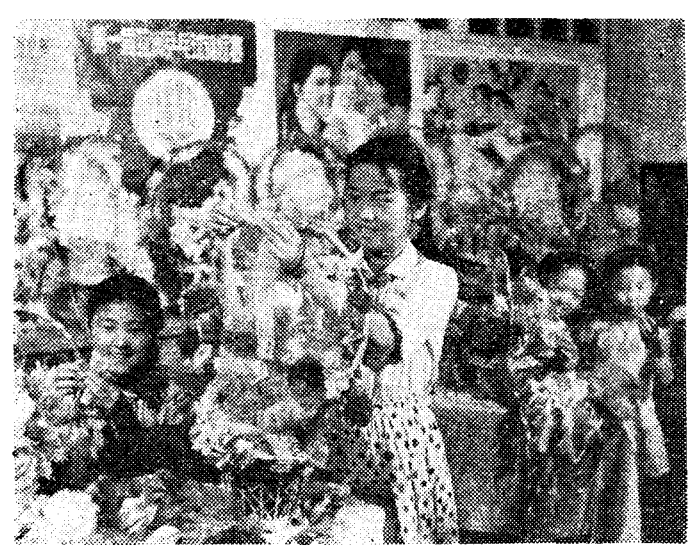
Making preparations for welcoming their Asian friends.