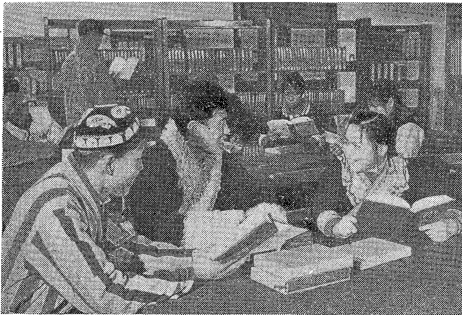
In a reading room at the Central Institute for Nationalities.

▲ An agreement on the exchange of goods and payments for 1972 between the Government of the People's Republic of China and the Government of the Czechoslovak Socialist Republic was signed recently in Peking.