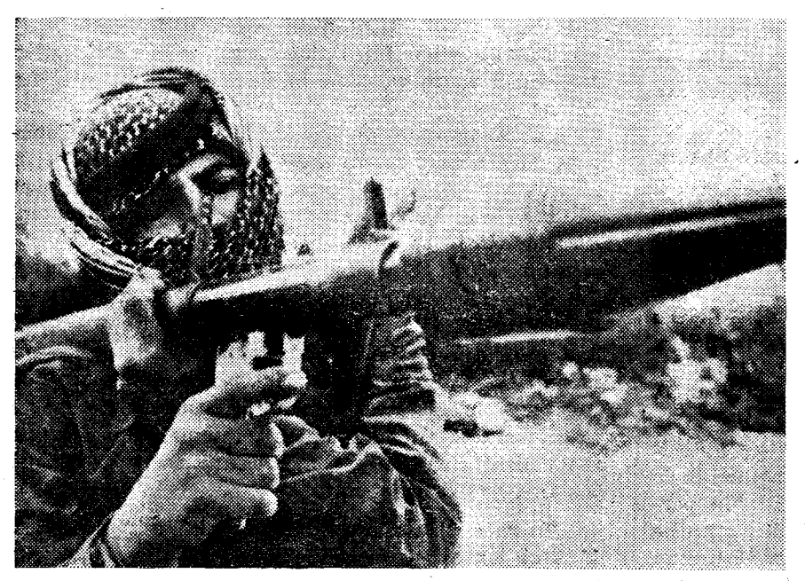
A Palestinian guerrilla fighter

The Palestinian guerrillas' scope of operation has spread everywhere in the Israeli-occupied areas and