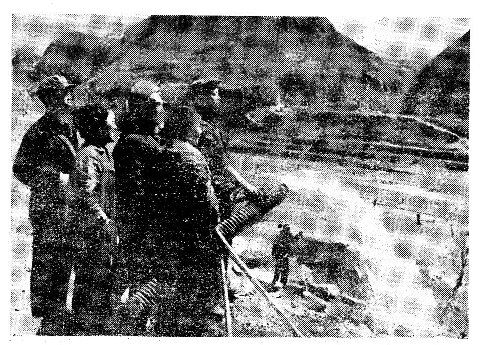
An electric pumping station, equipped with county-made motors and pumps, irrigates the land.

In the initial stage of construction, the county's cement plant did not have enough equipment and funds. Youngsters accumulated funds by collecting tree-seeds, took part in voluntary labour and started from scratch to build the plant in a desolate field. When the county's hardware plant was being built, there were only three stoves. The workers set up a workshop with broken mats and manufactured eight pieces of equipment by themselves to produce locks and iron parts for hand-carts. In what amounted to a technical revolution, the workers designed and manufactured dozens of pieces of equipment with which they produced sprayers in quantity and mechanized the production process. One hundred and six of the plant's 116 pieces of equipment were made by the workers.