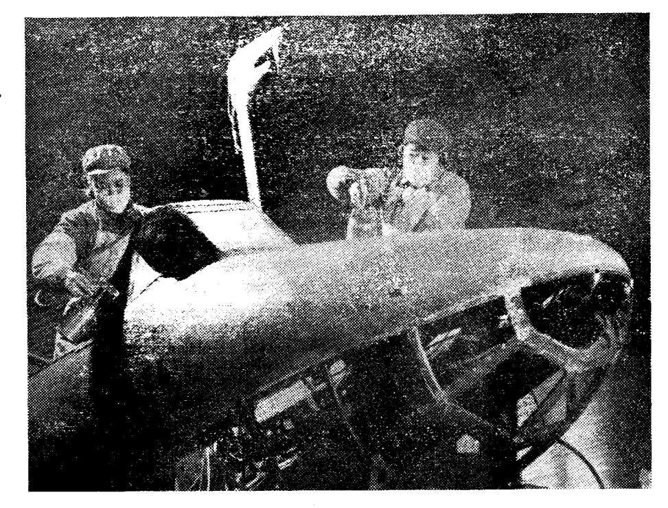
The Chinese People's Liberation Army has set up many small and medium-sized factories. Wives of the members of an aviation school under an air force unit are repairing an aircraft.

Militiamen in rural people's communes are implementing Chairman Mao's teaching "While mainly engaging in agricultural production, the peasants in the communes should at the same time study military affairs." Photo shows the Party branch secretary of Liuchuang Brigade in Hsinhsiang County, Honan Province, educating the militiawomen in revolutionary tradition.