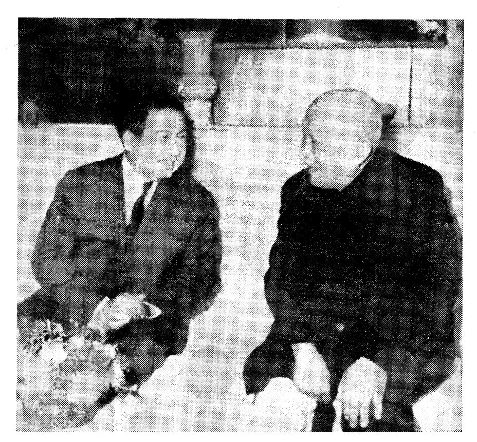
President Ton Duc Thang and Samdech Norodom Sihanouk

In south Viet Nam, the United States has tried its best to actively put into effect the "Vietnamization" plan to prolong the war of aggression with the illusory hope of a military victory. It has multiplied everywhere military operations with the massive use of aircraft,