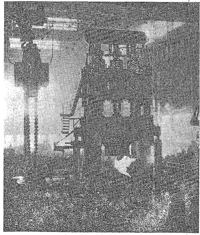
The Tientsin-made 6,000-ton hydraulic press is forging a big casting.

Compared with the same type of product made in China or abroad, this new press is relatively small and light and easy to operate, maintain and repair and can handle pieces of different sizes. The workers introduced new techniques for some parts and solved certain problems which had remained unresolved for this kind of product.