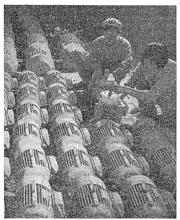
The Shulu County Electrical Machinery Manufacturing and Repair Plant in Hopei Province has made many 3-kw. motors to support agriculture. Workers are spraying paint on the motors.

Small iron and steel plants have gone up in about 300 counties and cities. A large-scale mass movement to locate coal deposits and set up coal-mines swept eight provinces and an autonomous region south of the Yangtze River. Their coal output last year increased by some 70 per cent, compared with 1969. This is ending their centuries-old irrational practice of depending on northern provinces for coal. Most counties and municipalities in Hunan Province have found coal reserves,